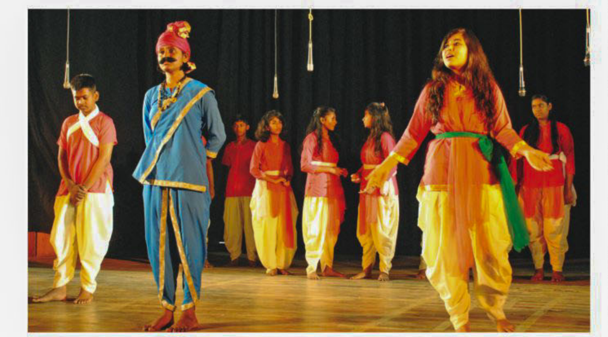
A scene from "Obhijan" staged by BIAM Laboratory School students.

Five plays were staged at Shaheed Titu Millenayatan in Bogra on Monday evening. The inter-school and inter-district theatre festival was arranged by Bogra Theatre, Little Theatre and Bhor Holo.