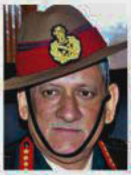
Gen Bipin Rawat