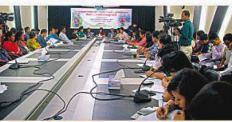
Participants at the discussion.

Non-indigenous people were involved in 85 percent of violence committed against indigenous women and girls in 2016 while law enforcement agency members were involved in two percent of the incidents, revealed a study conducted by Kapaeng Foundation. Thirteen percent of the 53 offences - took place in both hilly and plain areas of the country -- mentioned in the study the same year were committed by members of the indigenous community, according to the study. A total of 58 indigenous women and girls were tortured in those incidents while 6 were killed. This was disclosed at a discussion on "Government Pledges and Present Situation of Indigenous Women and Girls in Bangladesh", organised jointly by Kapaeng Foundation (KF) and Bangladesh Indigenous Women's Network (BIWN) at The Daily Star Centre yesterday.