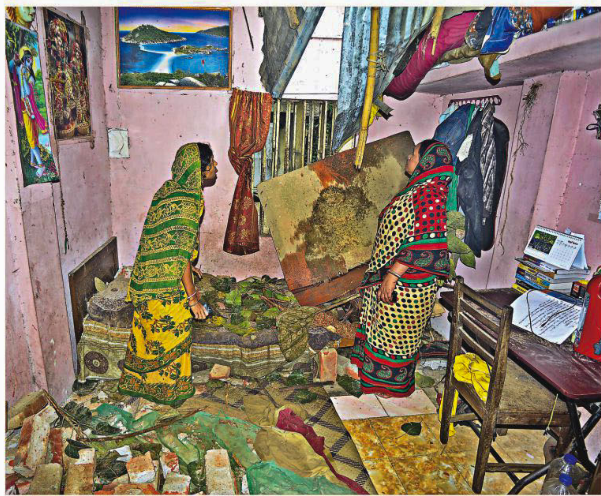
The room where four members of the family were injured after loose bricks from an under-construction multi-story building, right, fell through its tin roof, in Dhopapara area of Chittagong city's Kazirdewri yesterday. There was no safety canopy and nets around the building for fall protection.