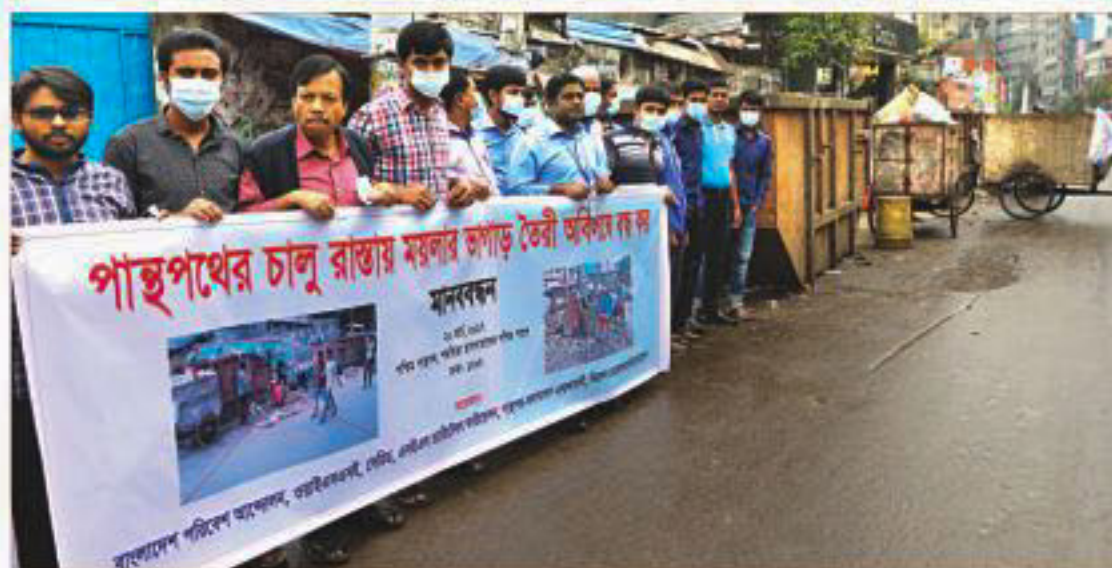
Several organisations including Bangladesh Poribesh Andolon (Bapa) and local residents of west Panthapath form a human chain near a dumpsite in the capital yesterday, demanding removal of the garbage containers from the street there.