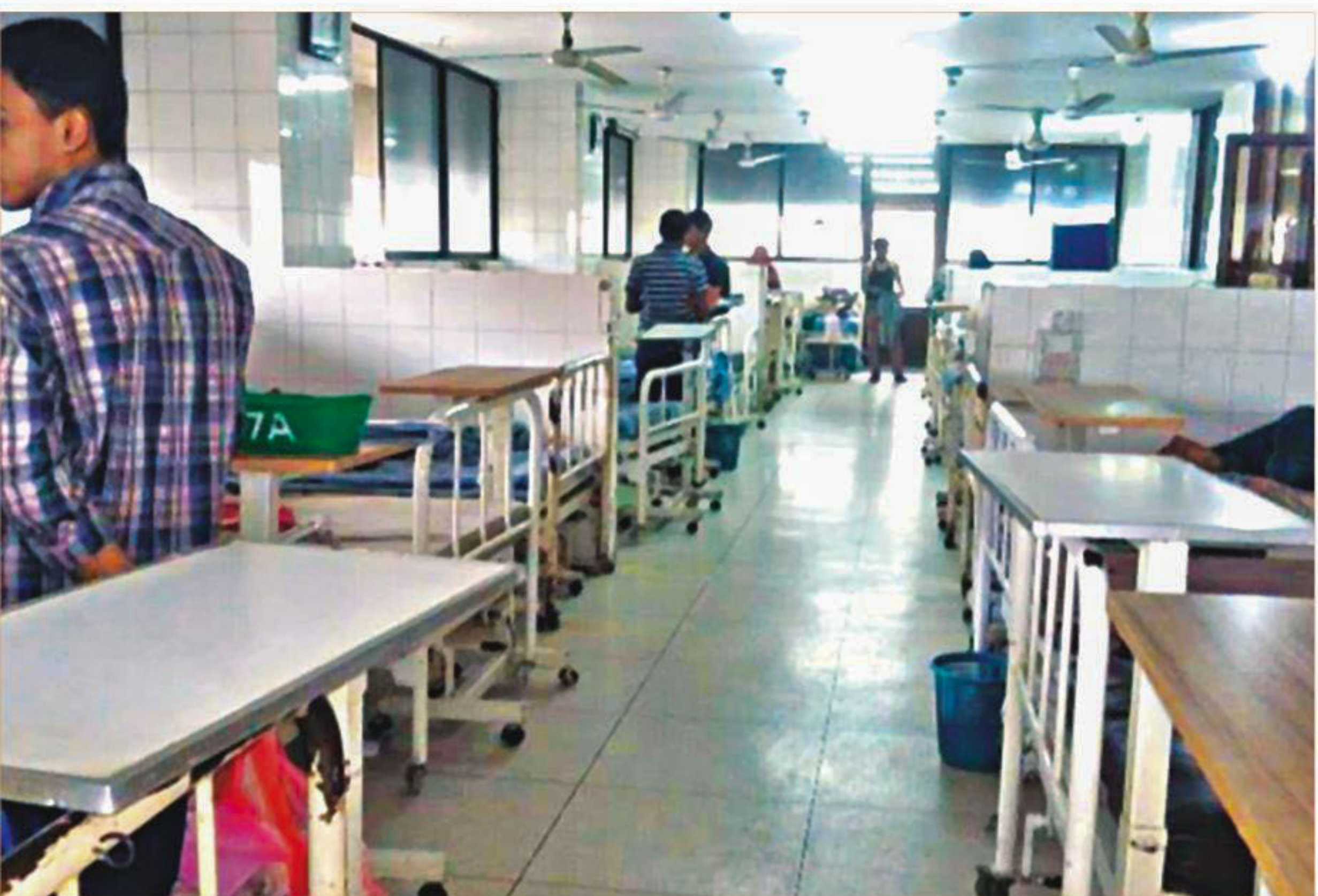
An almost empty ward at Bangladesh Medical College Hospital, where doctors, teachers, and interns have been on a strike since March 15. Many inpatients have left, while many were turned away at the outdoor section. The photo was taken yesterday.