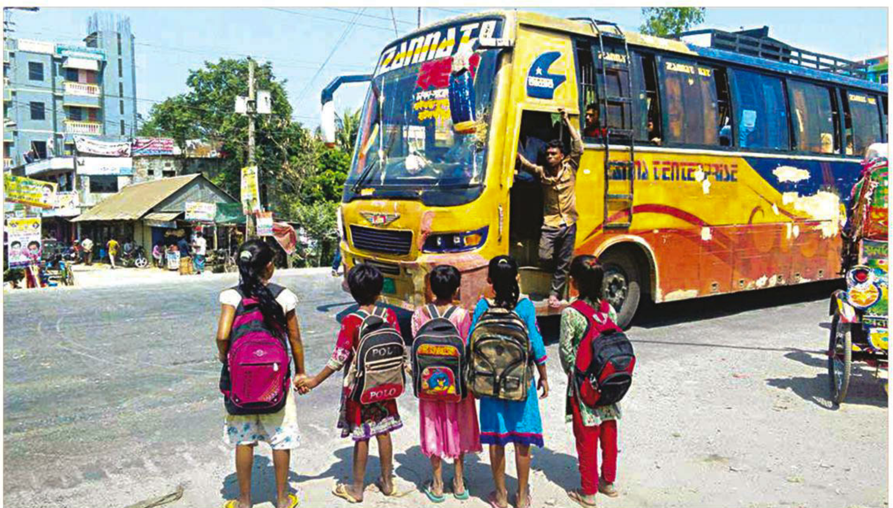
Without the company of an adult, a group of schoolchildren prepare to cross the busy Dhaka-Tangail highway in Mirzapur of Tangail yesterday. Although road accidents are a major cause of deaths in the country and pedestrians make up a large portion of the victim group, the general people seem to be indifferent to their own safety.