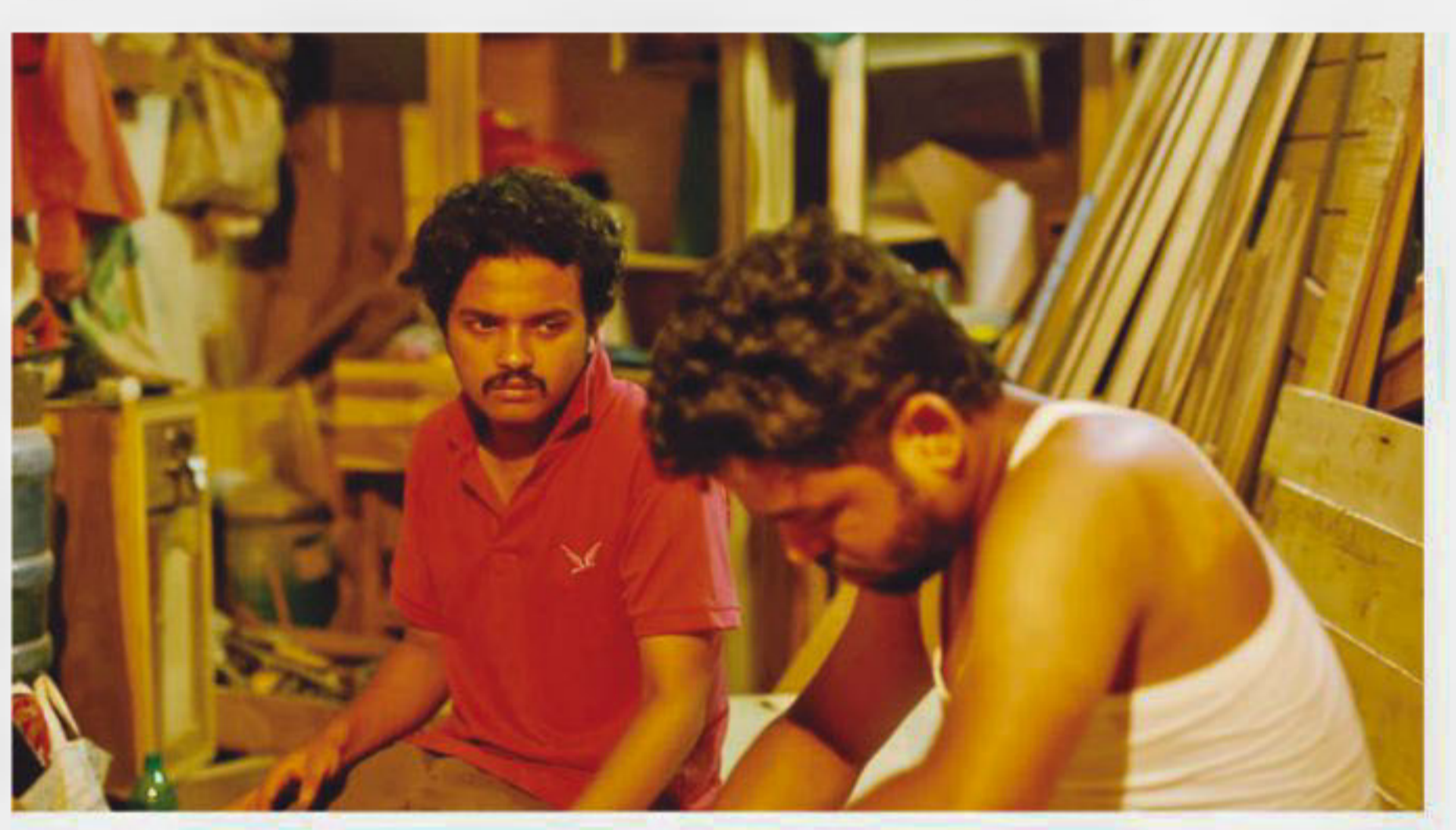
"Harun Miya'r Khoab" will be screened on March 21 at the festival.