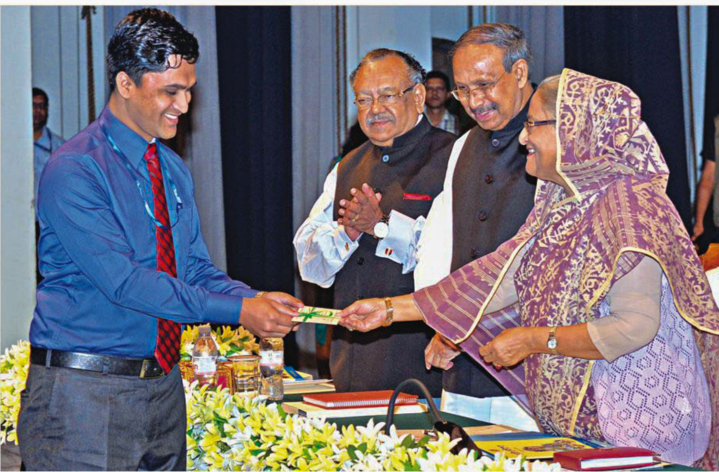
Prime Minister Sheikh Hasina distributes cheques of special donation among the scientists and researchers of various universities, organisations and agencies under the Bangabandhu Fellowship and National Science and Technology (NST) Fellowship in the capital's Osmani Memorial Auditorium yesterday.

She mentioned that under the project, 50 researchers were selected for the fellowship to obtain MS and 60 for PhD abroad and 100 more for PhD and 11 for post doctoral programmes at home. Earlier, Hasina distributed Bangabandhu Fellowship to two recipients, NST fellowship to four and cheques of Research Grant among four recipients.