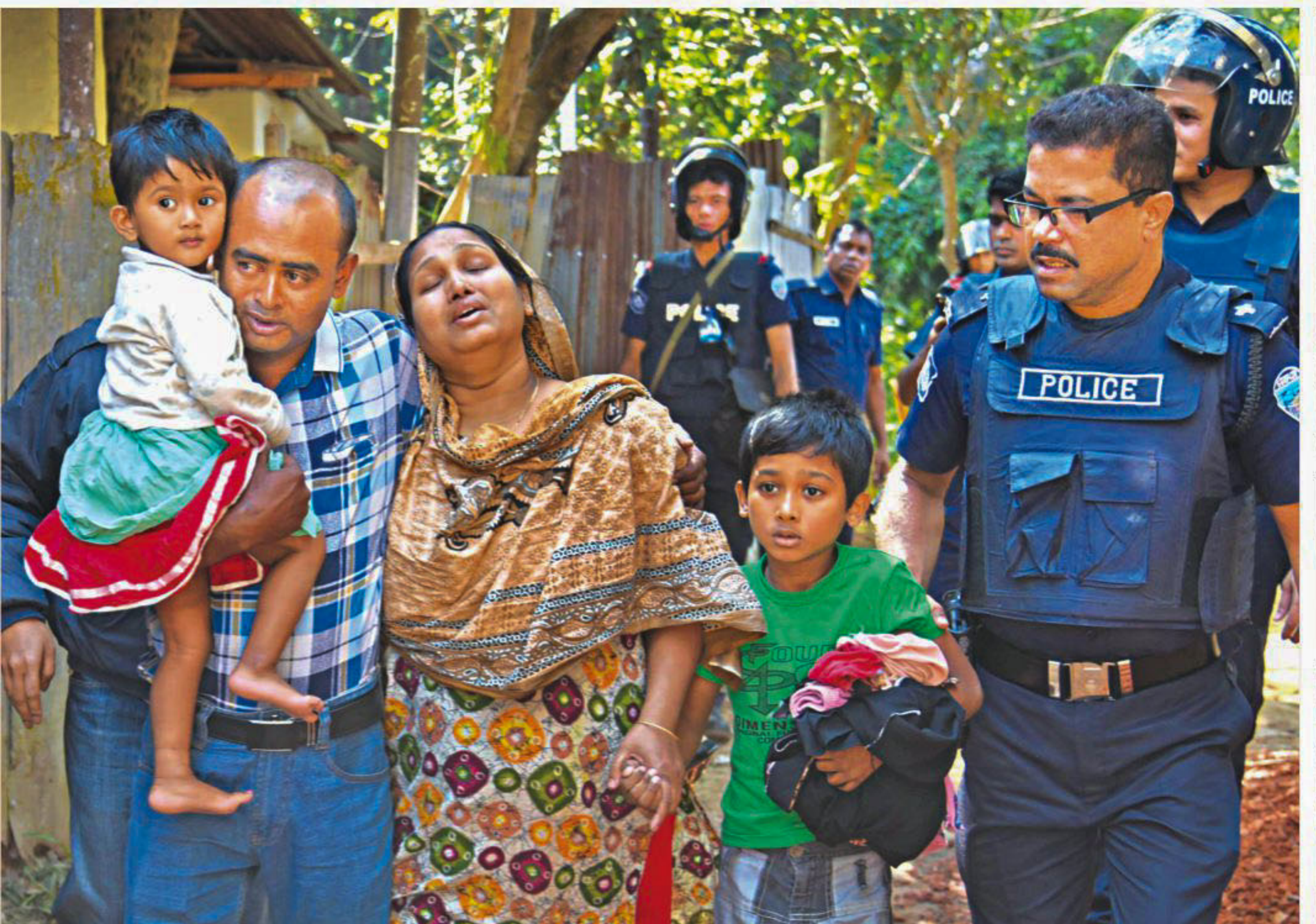
Families being taken to safety from a two-storey building, Chayaneer, yesterday morning in Premtala area of Chittagong's Sitakunda, where around 20 residents were trapped inside their flats for more than 16 hours as the law enforcers carried out a raid on a militant hideout in the building.