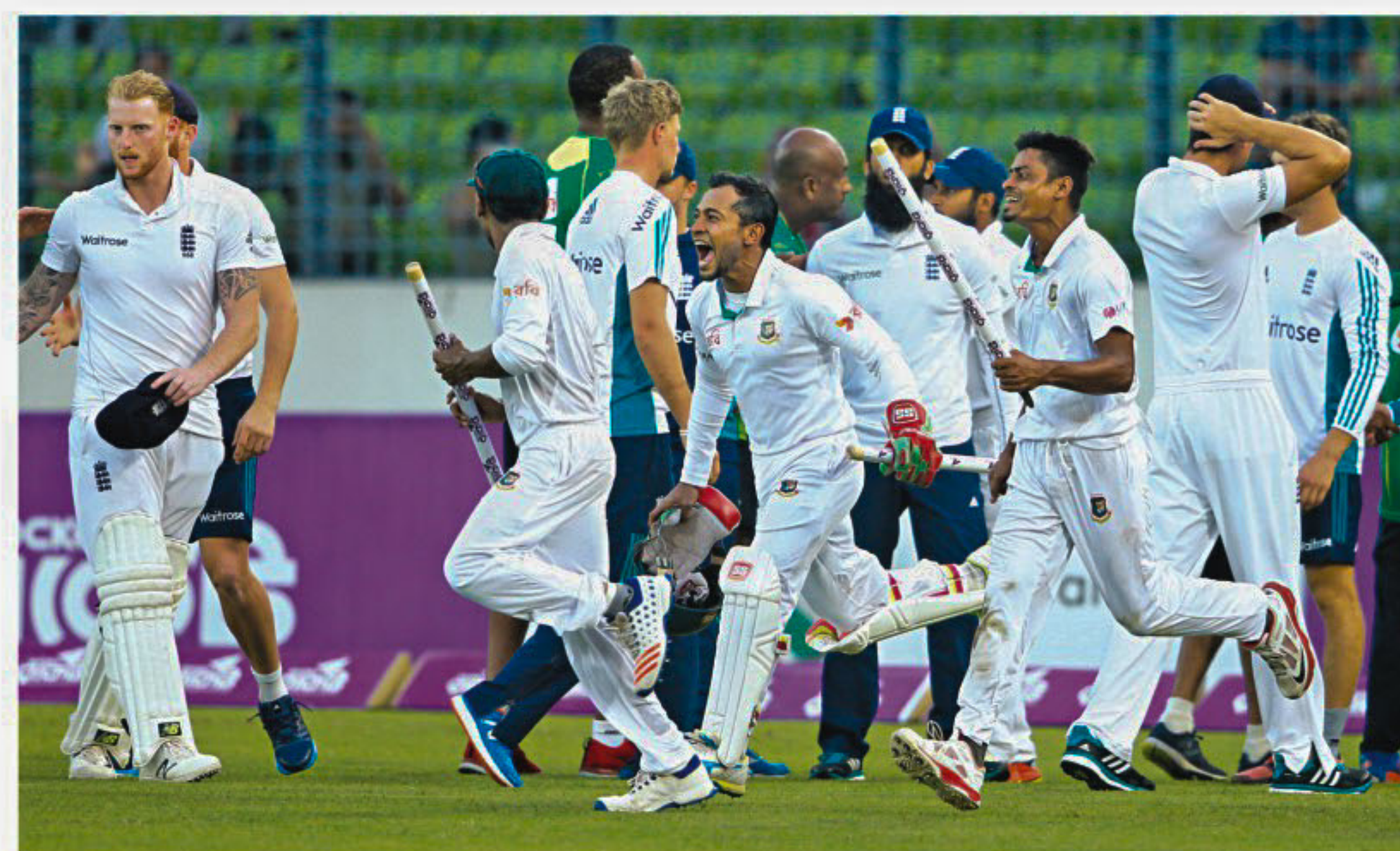
Anyone who has seen all the highs and lows will argue that the greatest moment in Bangladesh's Test history came in October 2016 when the Tigers defeated England in Mirpur.