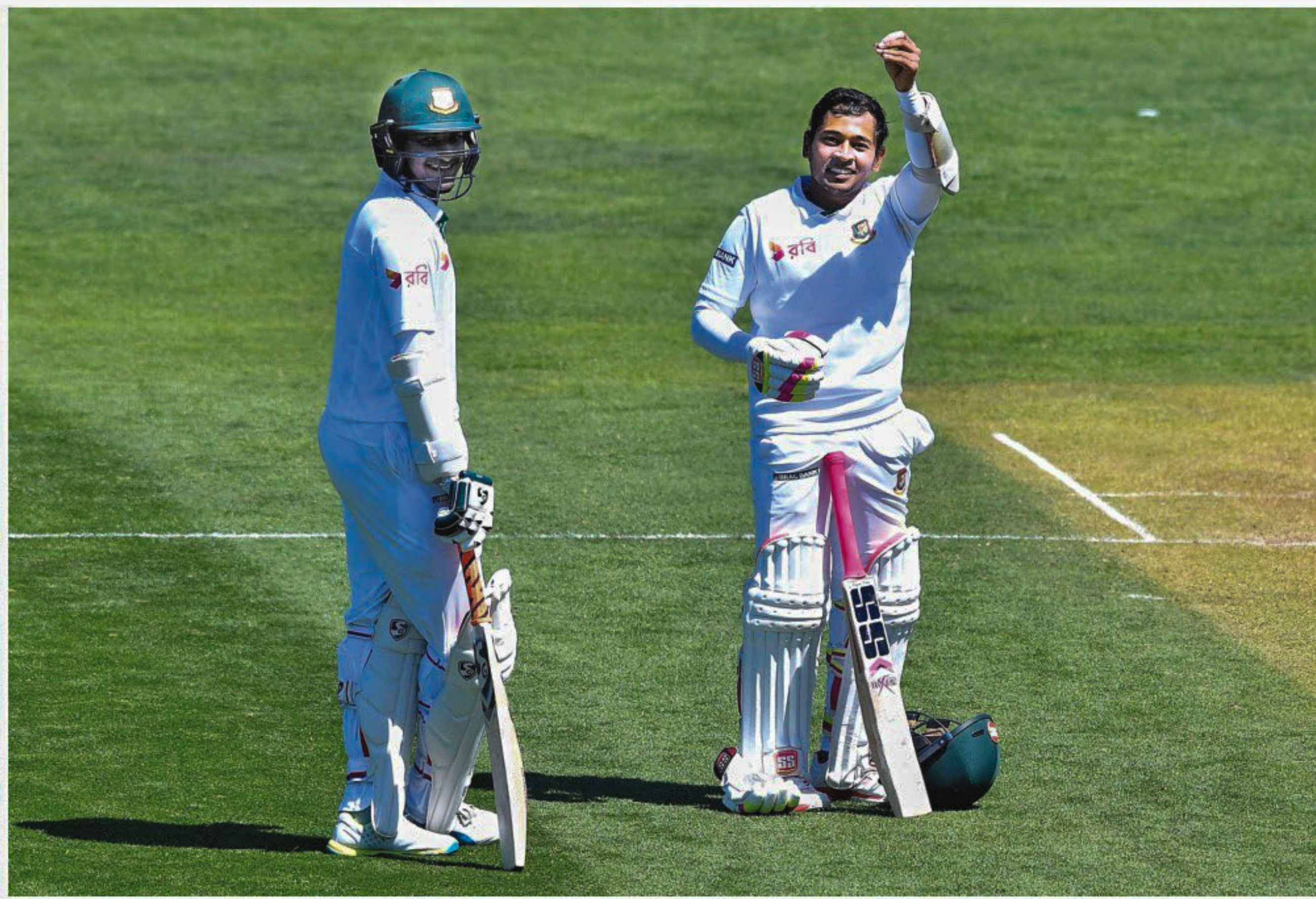
Mushfiqur Rahim shows the lucky coin which he kept after scoring his fourth overseas century, making him the only Test captain-cum-wicketkeeper to score more than one century outside his own country.