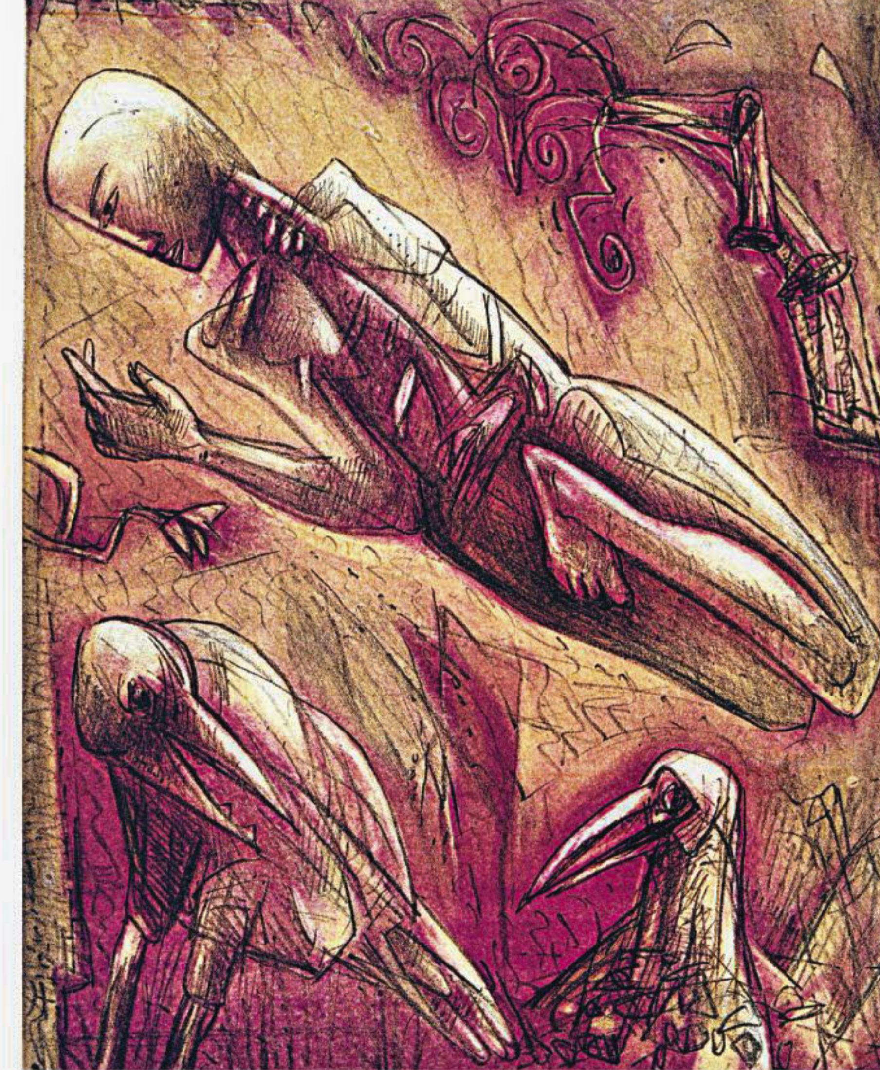
"Reflection"; Lithograph by Ajit Seal.

There are some abstract and semi-abstract works at the exhibition, that is open daily from 3pm to 8pm till March 24.