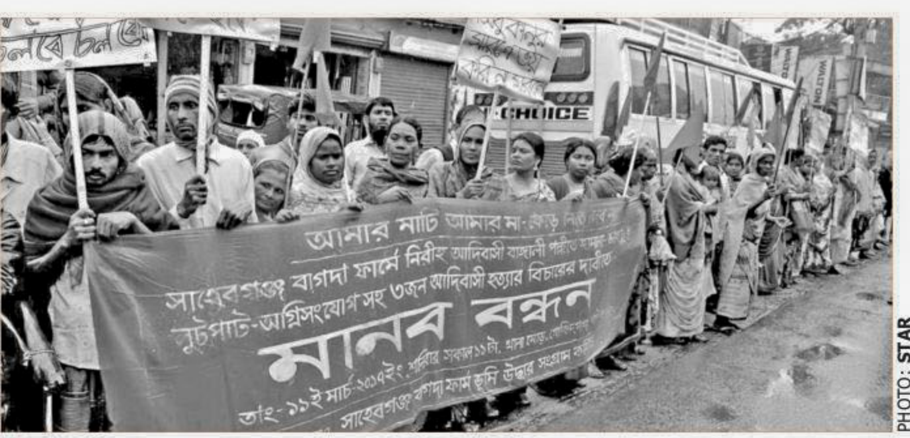
Santals form a human chain along Rangpur-Bogra highway at Gobindaganj in Gaibandha yesterday demanding return of their forefathers' land and punishment of those involved in torching and looting their houses in November last year.