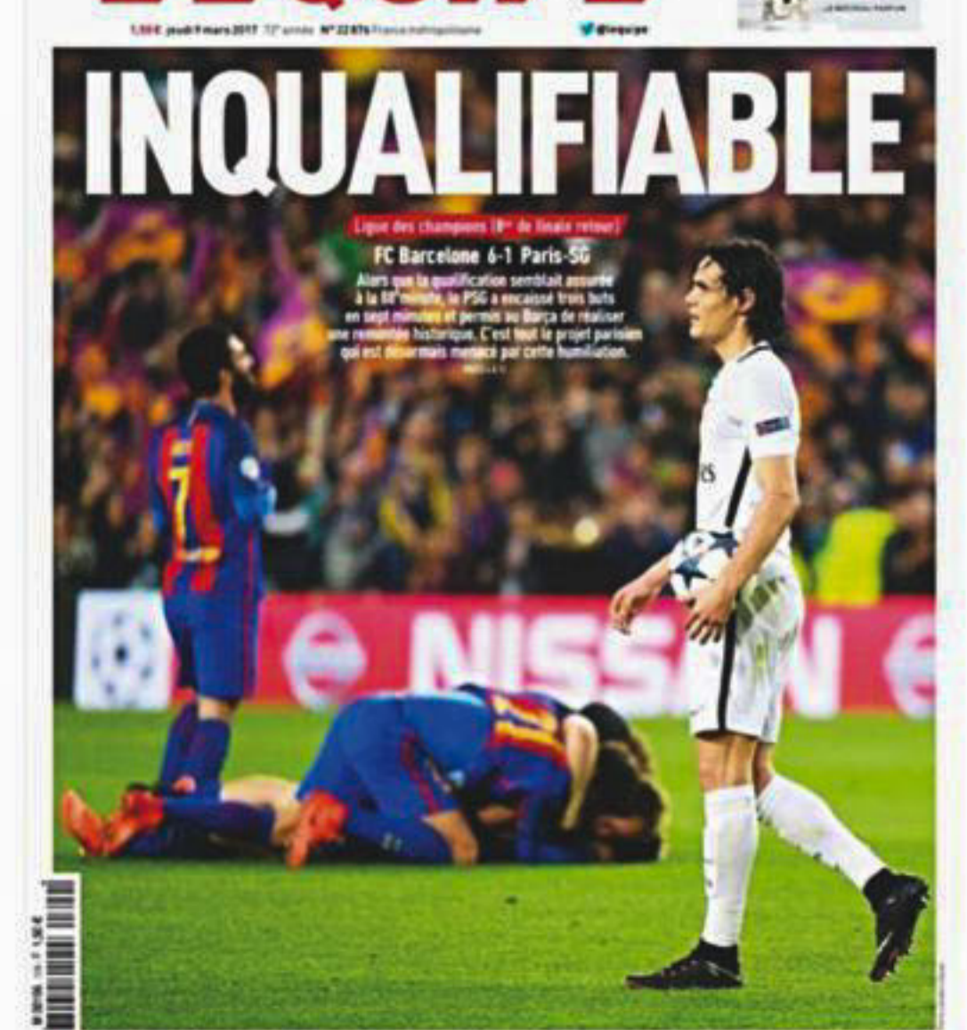
L'Equipe went with the headline 'Unspeakable' - a nod to a previous front page from 1993 after the French national team failed to reach the 1994 World Cup.