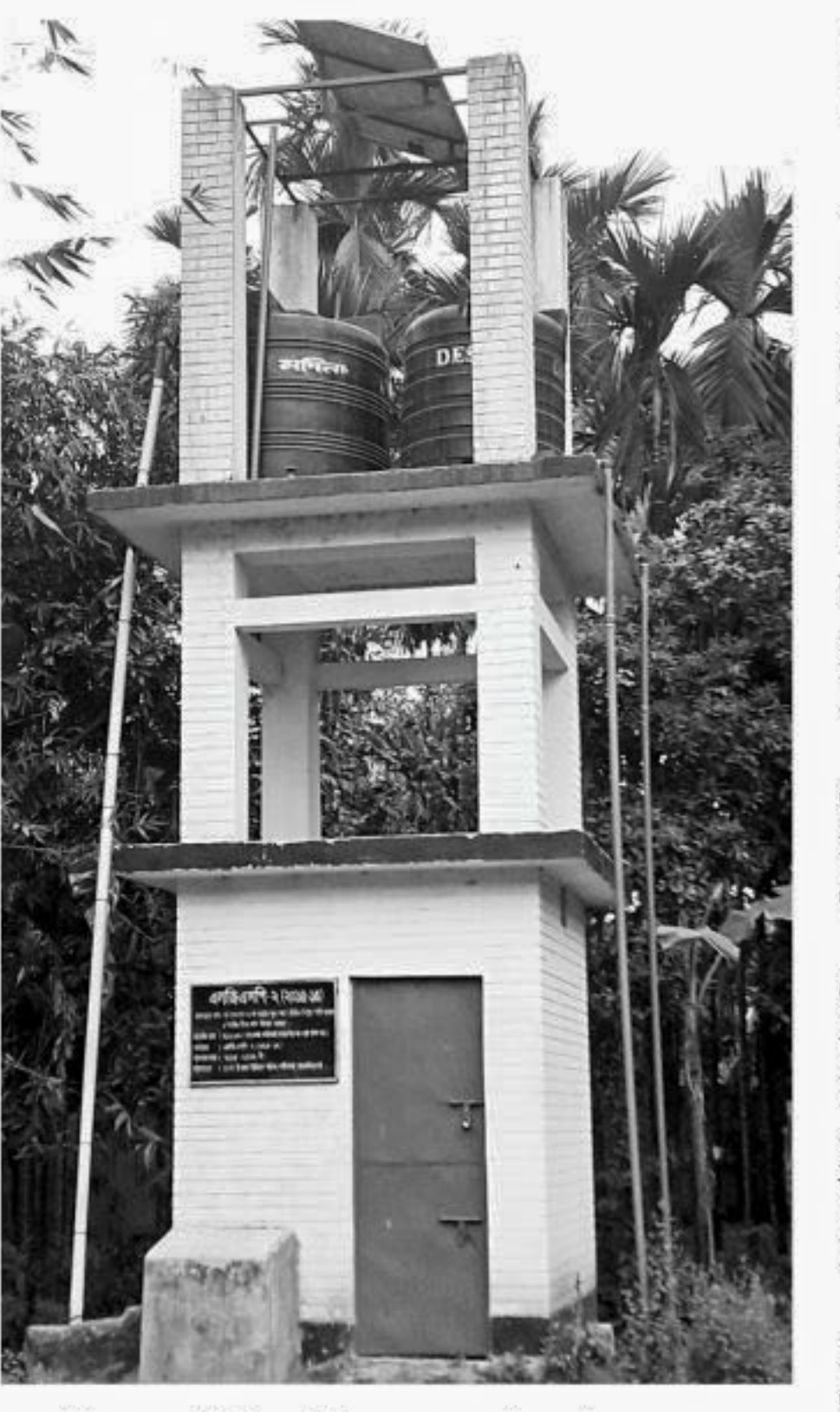
A woman collects drinking water from the supply line of a solar pump beside her house at Purbo Bejgram village of Tangbhanga union in Lalmonirhat's Hatibandha upazila. Right, the solar power run pump meant for supplying pure water for the villagers.