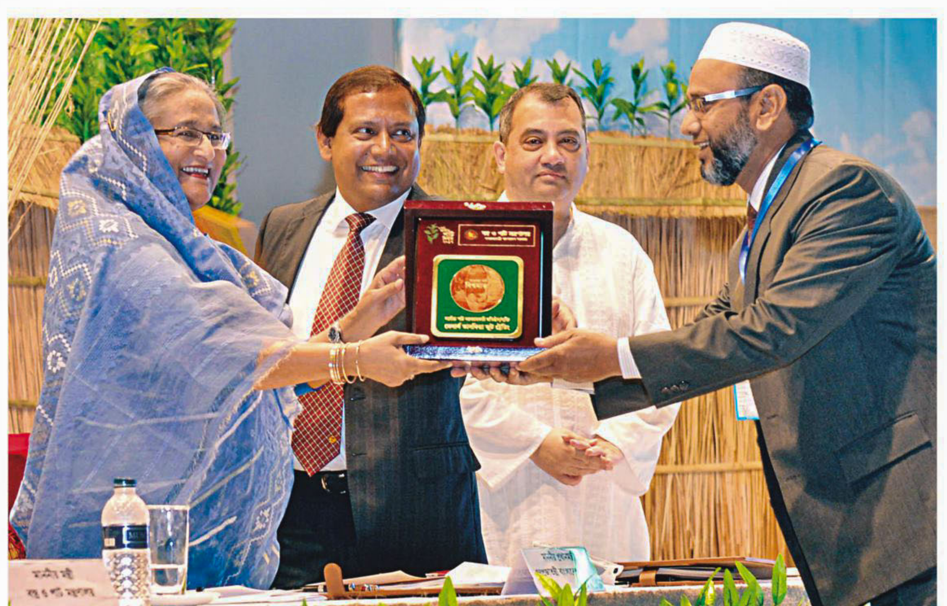
Prime Minister Sheikh Hasina presents an award winner with a crest during a programme at the capital's Krishibid Institution, Bangladesh, marking National Jute Day (March 6), yesterday. Individuals and organisations were awarded under 10 categories for their contributions to the sector.