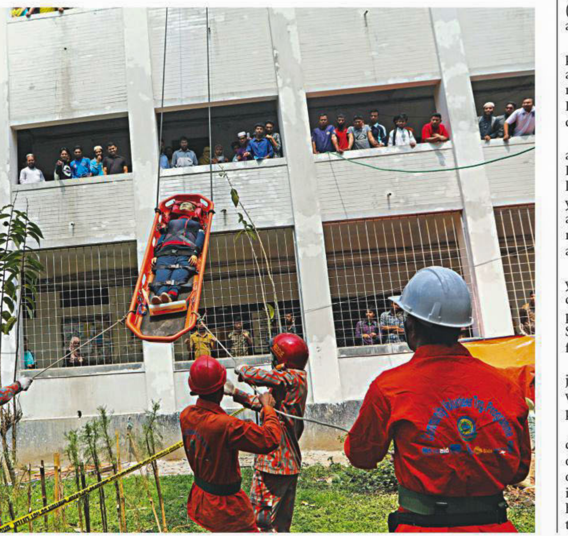
A fire drill at the Arts Building of Dhaka University yesterday, organised by Bangladesh Fire Service and Civil Defence, marking National Disaster Preparedness Day.