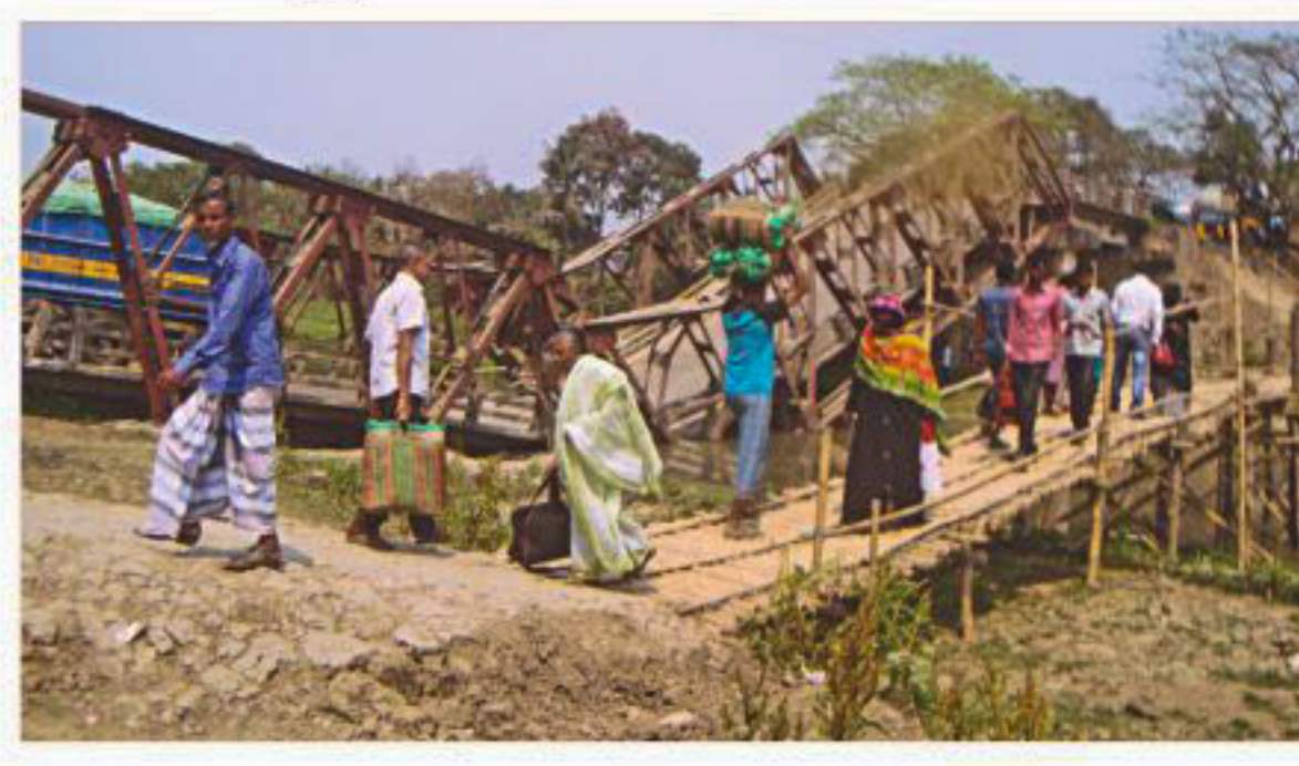
OUR CORRESPONDENT, Jhenidah

An iron bridge on Jessore-Dhaka highway at Shimakhali Bazar in Shalikhia upazila of Magura, which collapsed about three weeks ago, still lies without repair, causing immense sufferings to the commuters.