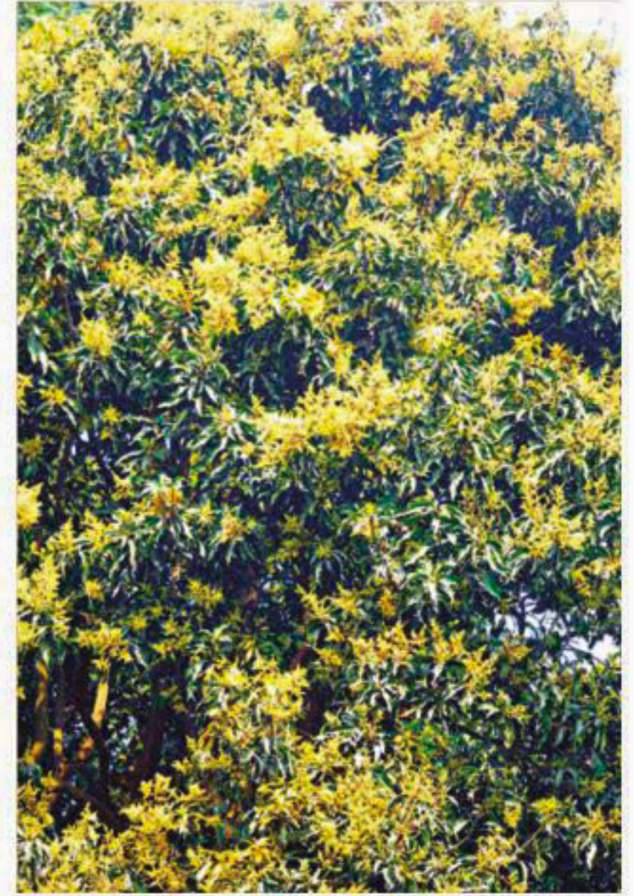
Mango flowers bloom in abundance in the orchards in five northern districts under Rangpur agriculture region as well as in south-western Jessore, heralding a bumper yield of mangoes. The photos were taken from Nilphamari municipality, left, and Sharsha upazila of Jessore.