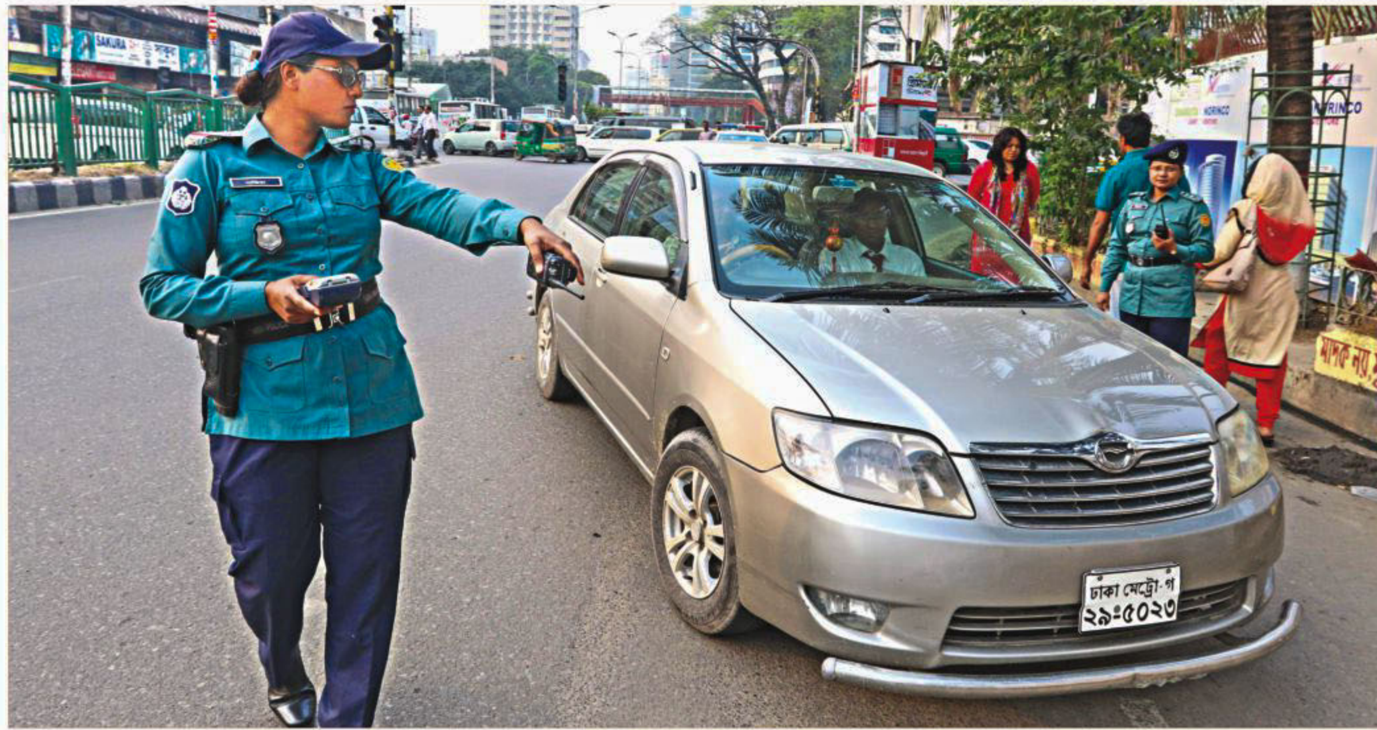
Two policewomen pull over a vehicle at the Sonargaon intersection in the capital yesterday. The presence of women in law-enforcement agencies in Bangladesh, which was rare even a few years ago, reflects the theme, "Be bold for change", adopted for this year's International Women's Day.

Today, on the occasion of the International Women's Day, we dedicate our business pages to women leadership, their business ventures, entrepreneurship and hurdles.