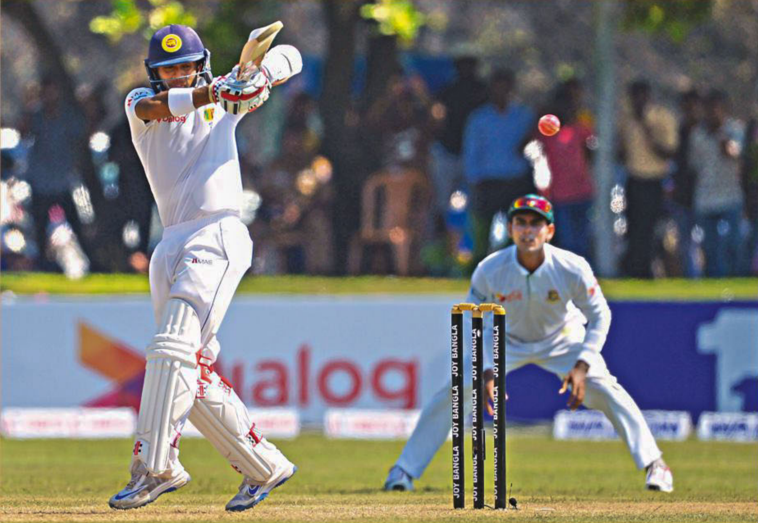
Sri Lanka batsman Kusal Mendis pulls one during the first day of the opening Test against Bangladesh at the Galle International Cricket Stadium on Tuesday. The right-hander, who got a reprieve having edged a no-ball to the keeper on the first delivery he faced, went on to remain unbeaten on 166 as the hosts piled up 321 for four at stumps.