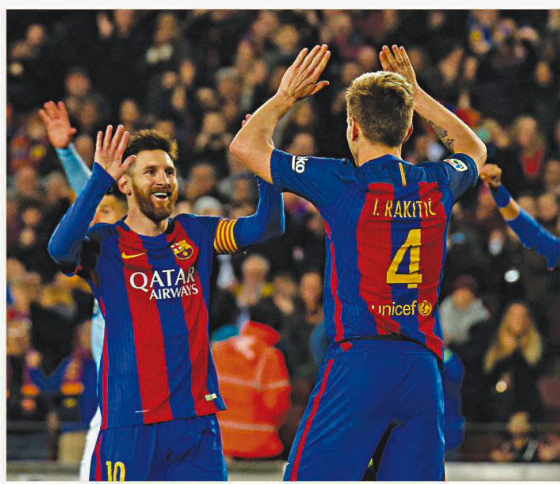
Barcelona forward Lionel Messi (L) scored two incredible solo goals against Celta Vigo in their La Liga match on Saturday and his side are hoping the Argentine ace is at the peak of his powers when they look to overturn a 4-0 deficit against PSG in their Champions League round of 16 match on Wednesday.

Gijon 6-1 in their previous outing -- both scorelines which would be good enough when PSG visit in midweek. And Enrique said he couldn't have wished for a better build-up to the ultimate challenge. "That it is one of our best performances in the last few months is without doubt," he said. "If I had to choose the way in which we would go into the Champions League game against PSG it would be very similar to these last two games: scoring lots of goals, the team gaining confidence and the players getting stronger." "I think we are in great form for a very difficult tie, that is not lost yet." "I am sure we are going to have opportunities to get ourselves back in it and we will try until the death." Enrique's name was chanted by the crowd at the Camp Nou on Saturday. Banners were also raised towards the end of the match willing Barca's players to believe in the most unlikely of comebacks against PSG. "The fans value a lot what these players have won, the hunger they have and what they show in every game," added Enrique. "In my time here I have never once seen a poor attitude in any of my players." "Barca fans should be loyal and, above all, have confidence that the team can come back."