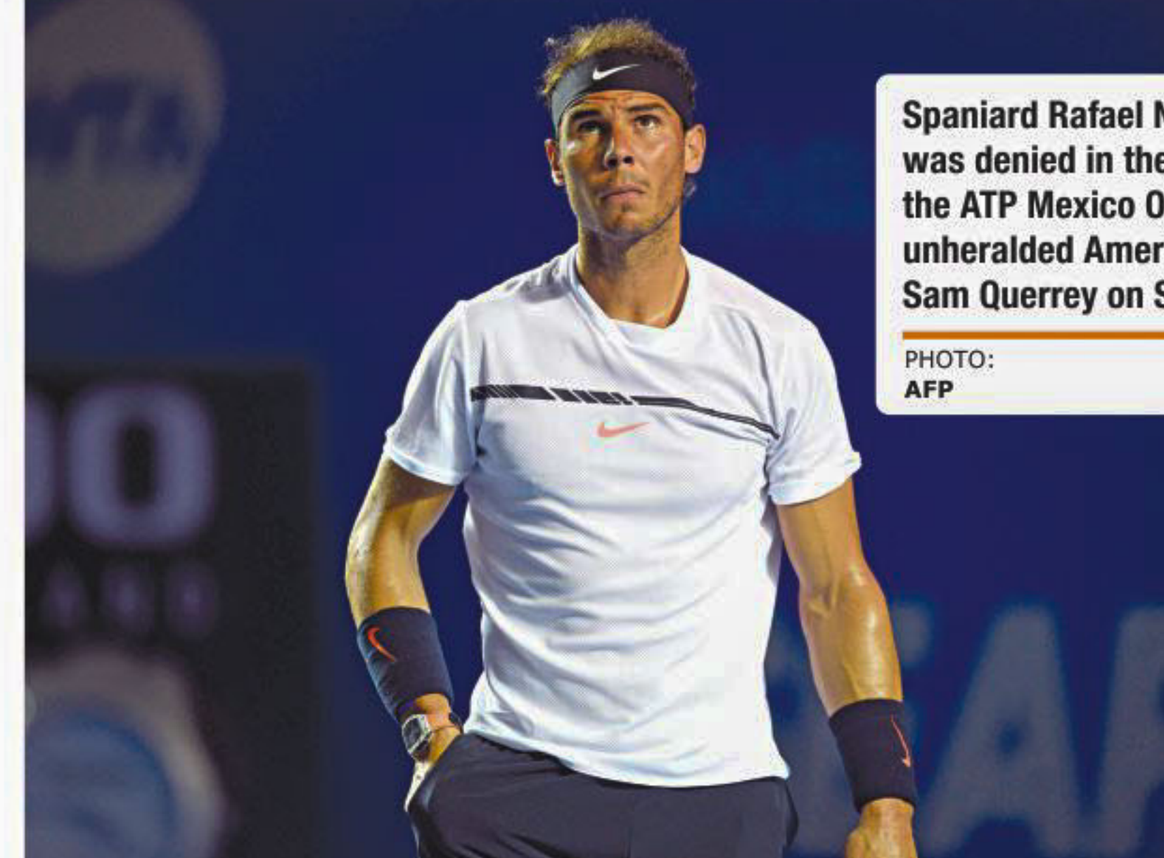
Spaniard Rafael Nadal was denied in the final of the ATP Mexico Open by unheralded American Sam Querrey on Sunday.

"He played very well, almost reaching perfection," Nadal said. "I played under a lot of pressure because of his serve and baseline game. He left me with very few options, and the few I had he also played good."