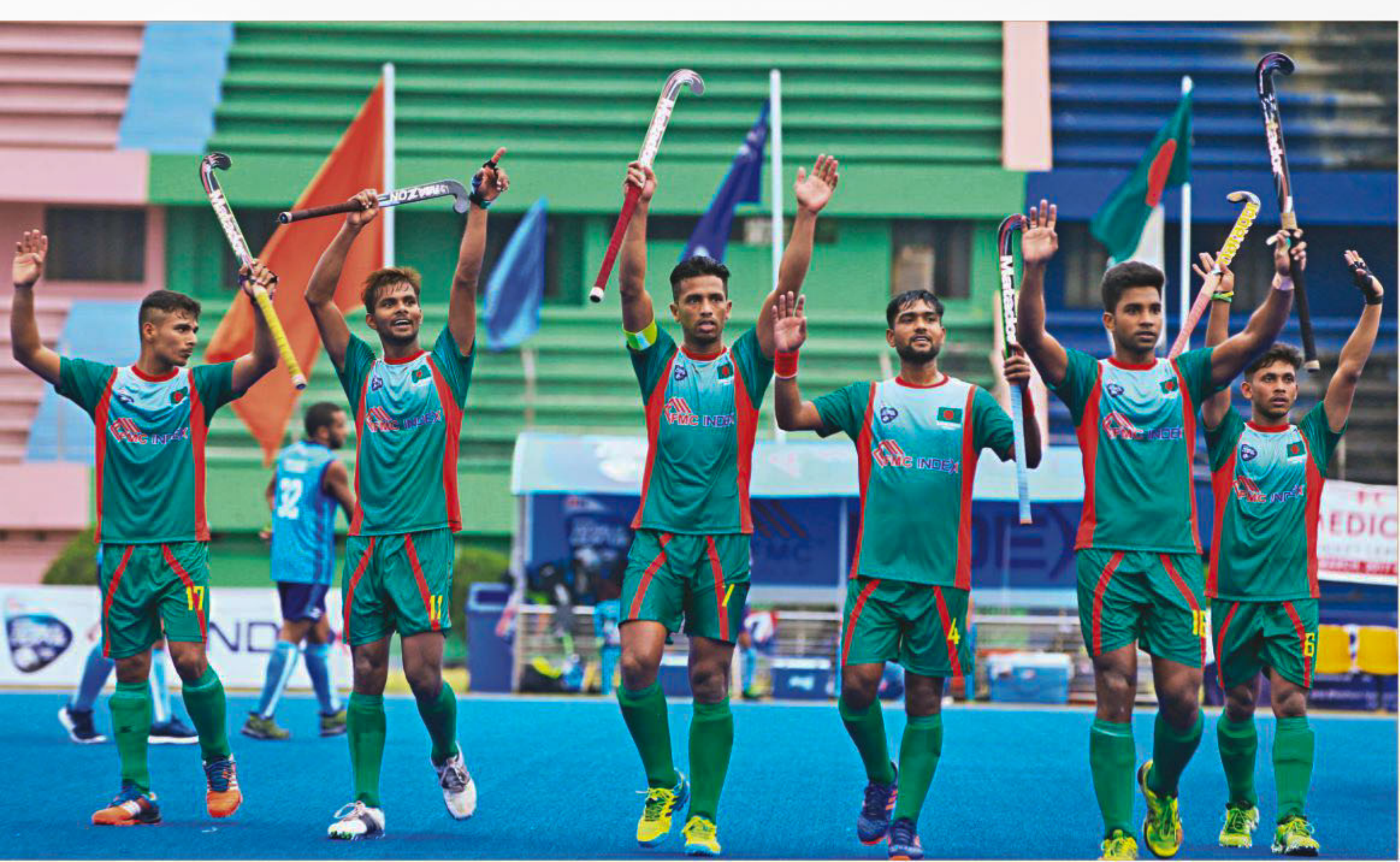
Members of the Bangladesh hockey team celebrate after securing a thumping 5-1 victory against Fiji in their Hockey World League Round-2 encounter at the Maulana Bhasani Hockey Stadium yesterday.