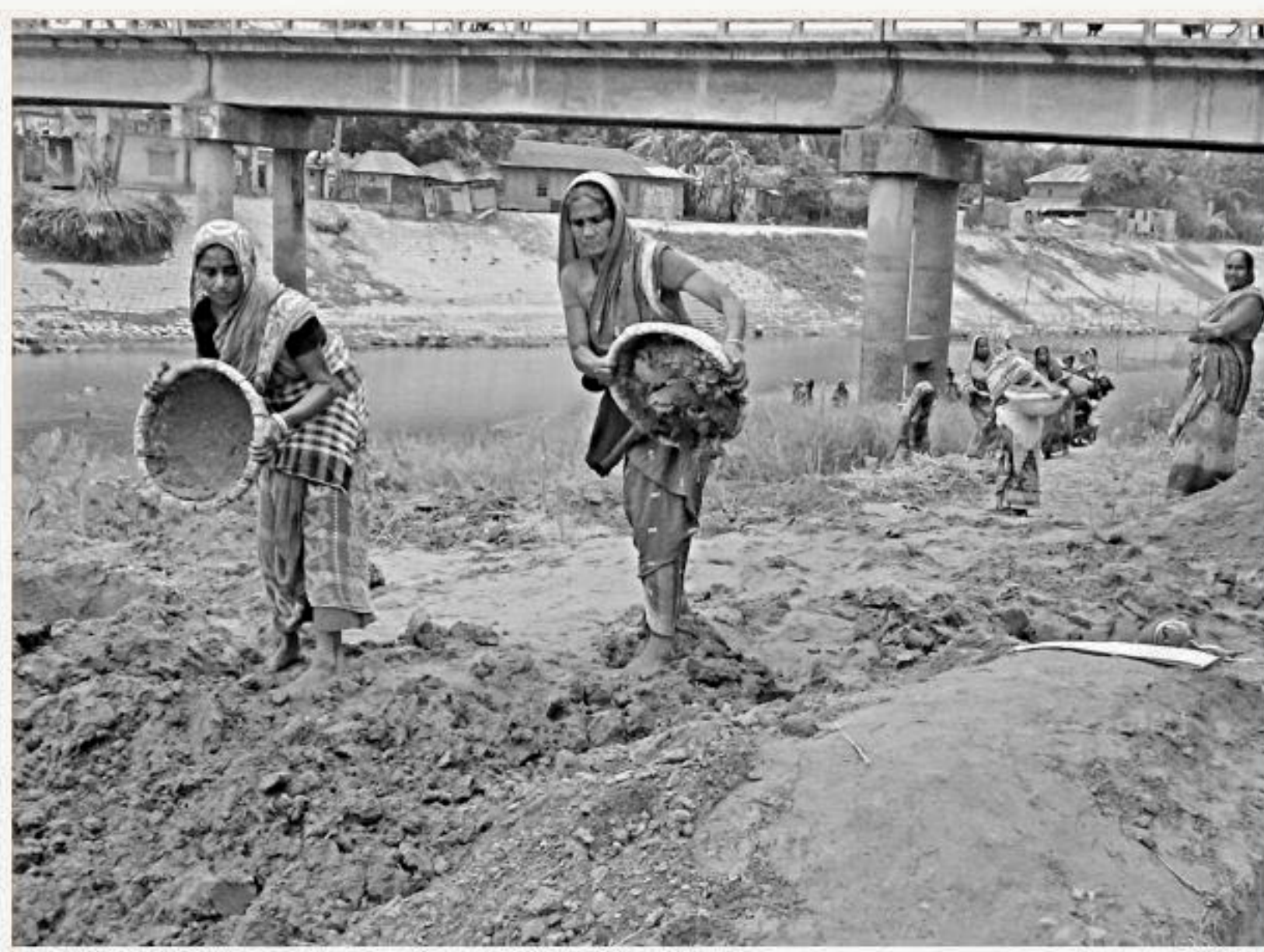
Workers, allegedly being paid by the government's "Employment Generation Programme for the Poorest", building the Jubo League office on the bank of the Barnoi river.

Police also recovered a pistol and a revolver from them, police said, adding that those were used in the killing.