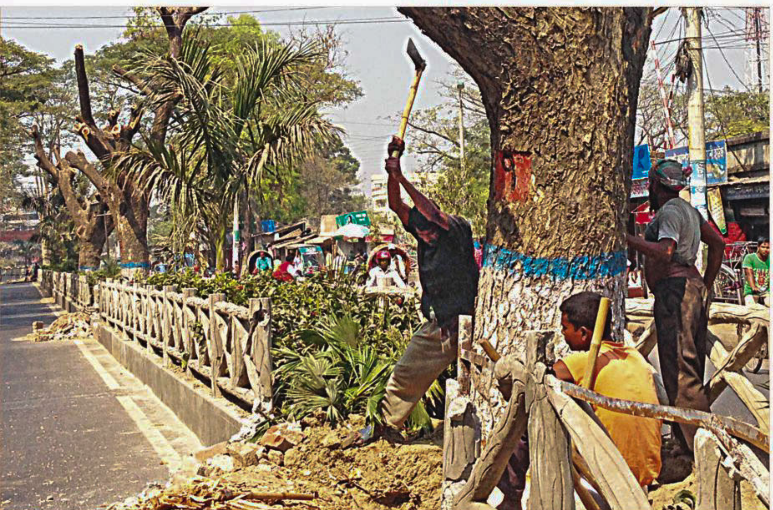
A large tree on a divider of Greater Road in Rajshahi city being felled yesterday. The Roads and Highways Department recently sold 17 such trees for felling, which according to them, as per request of the city corporation for ensuring public safety.