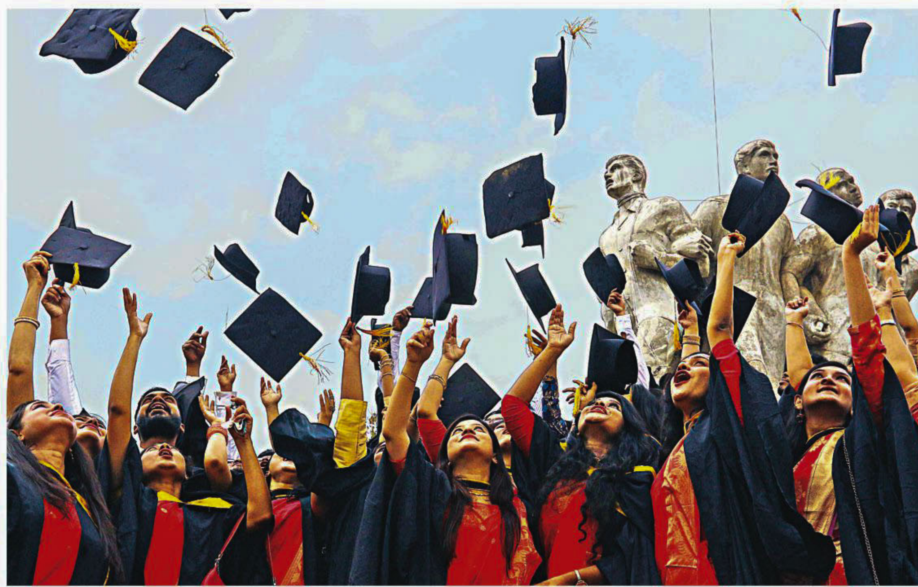
Dhaka University graduates celebrate during the 50th convocation yesterday.