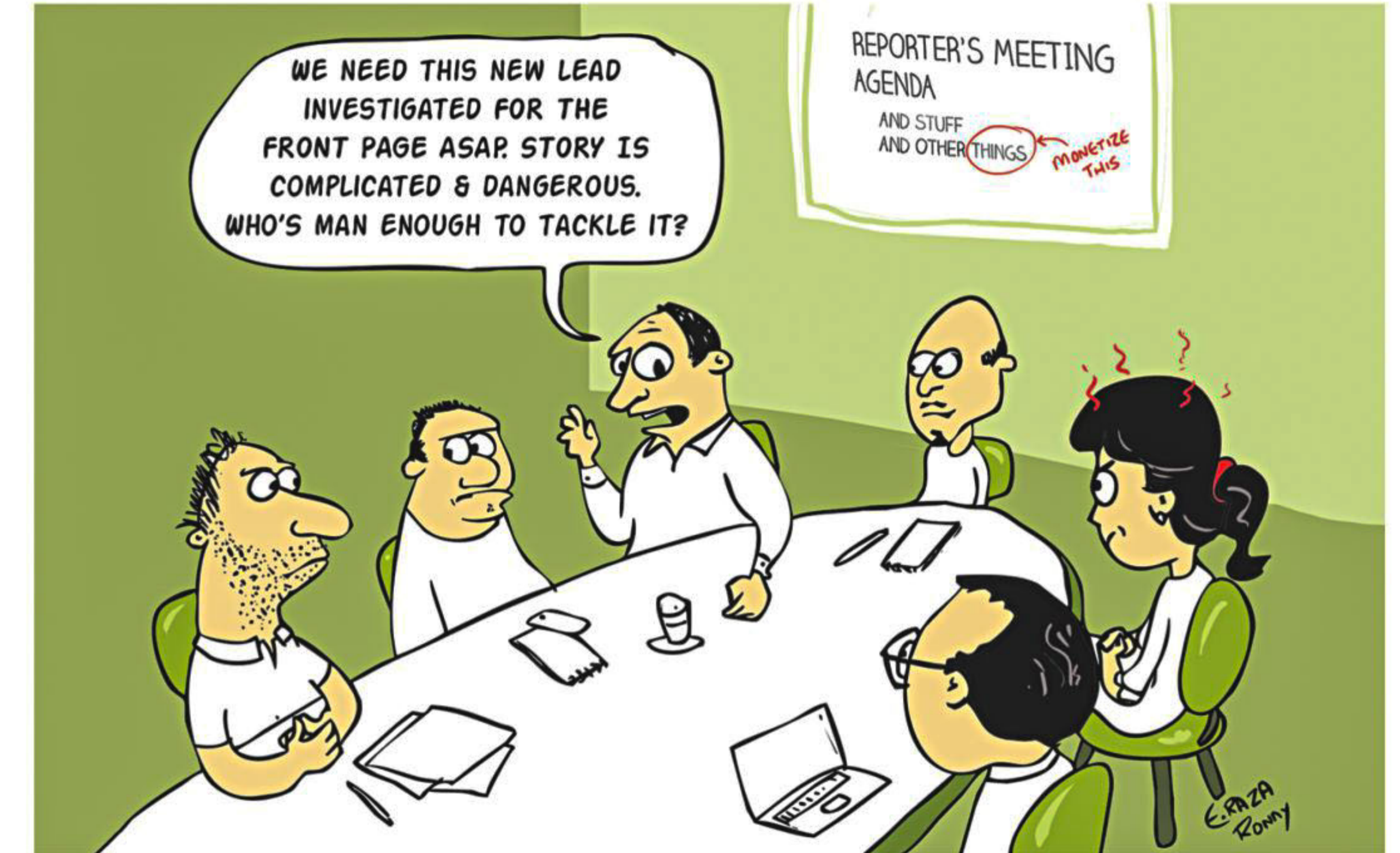
ILLUSTRATION: E. R. RONNY

The word made me not feel welcome and is probably the reason why there are so few female reporters covering