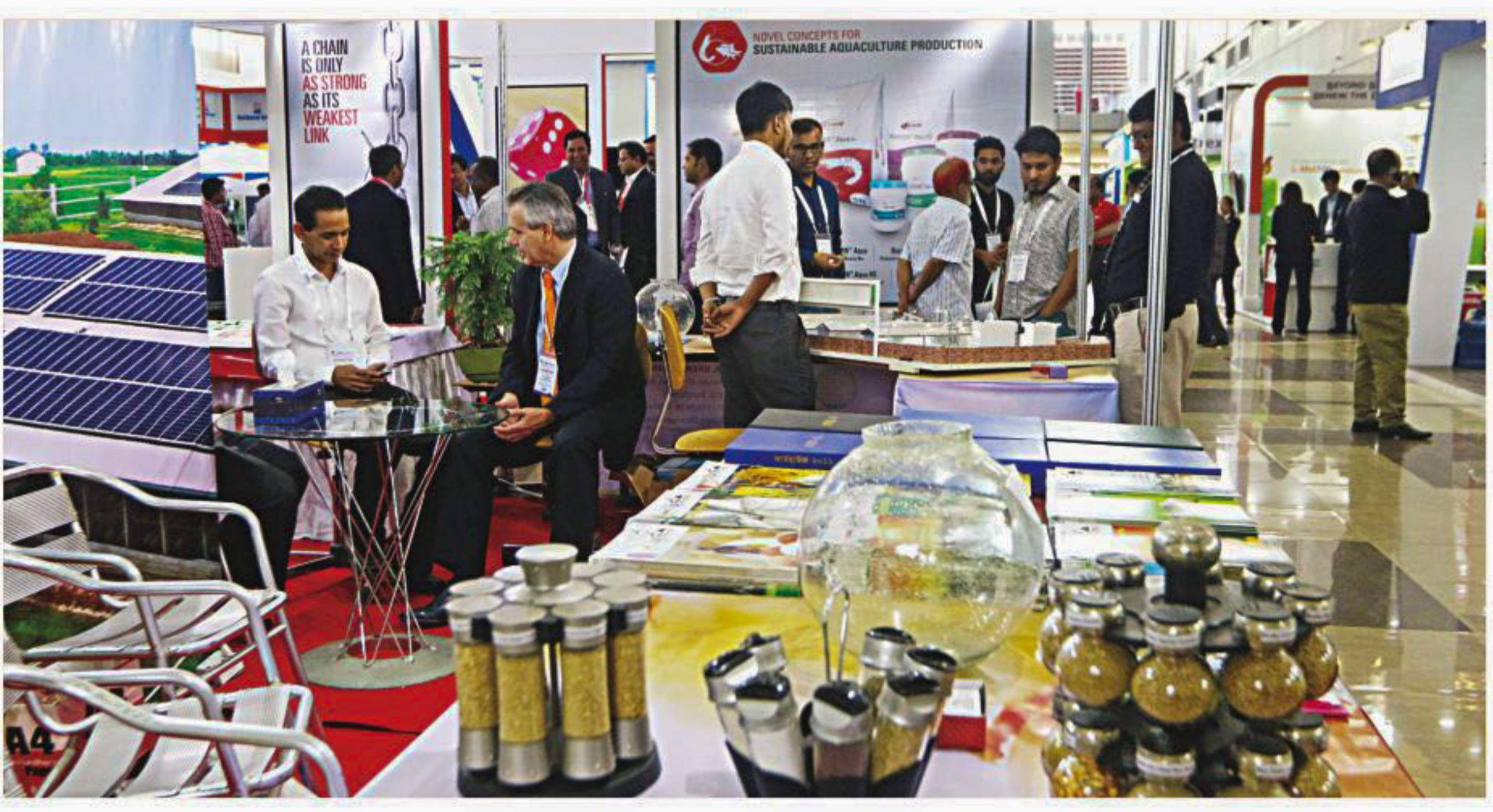
People visit a stall at a poultry show at International Convention City Bashundhara in Dhaka yesterday.

DHAKA FRIDAY MARCH 3, 2017, FALGUN 19, 1423 BS