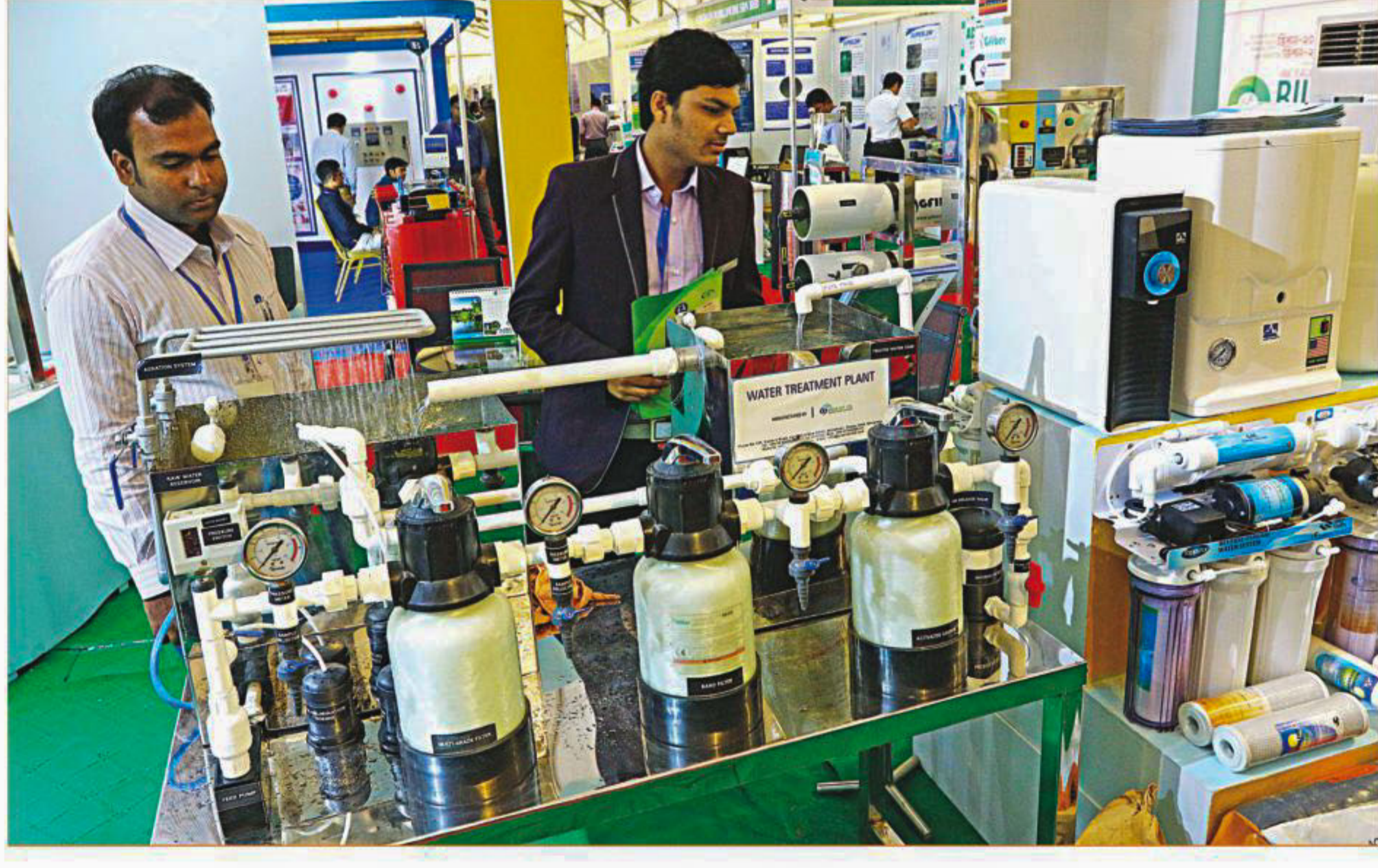
Stall attendants wait for visitors at the three-day Bangladesh Infrastructure Innovation and Development Expo that began at Bangabandhu International Conference Centre in Dhaka yesterday.