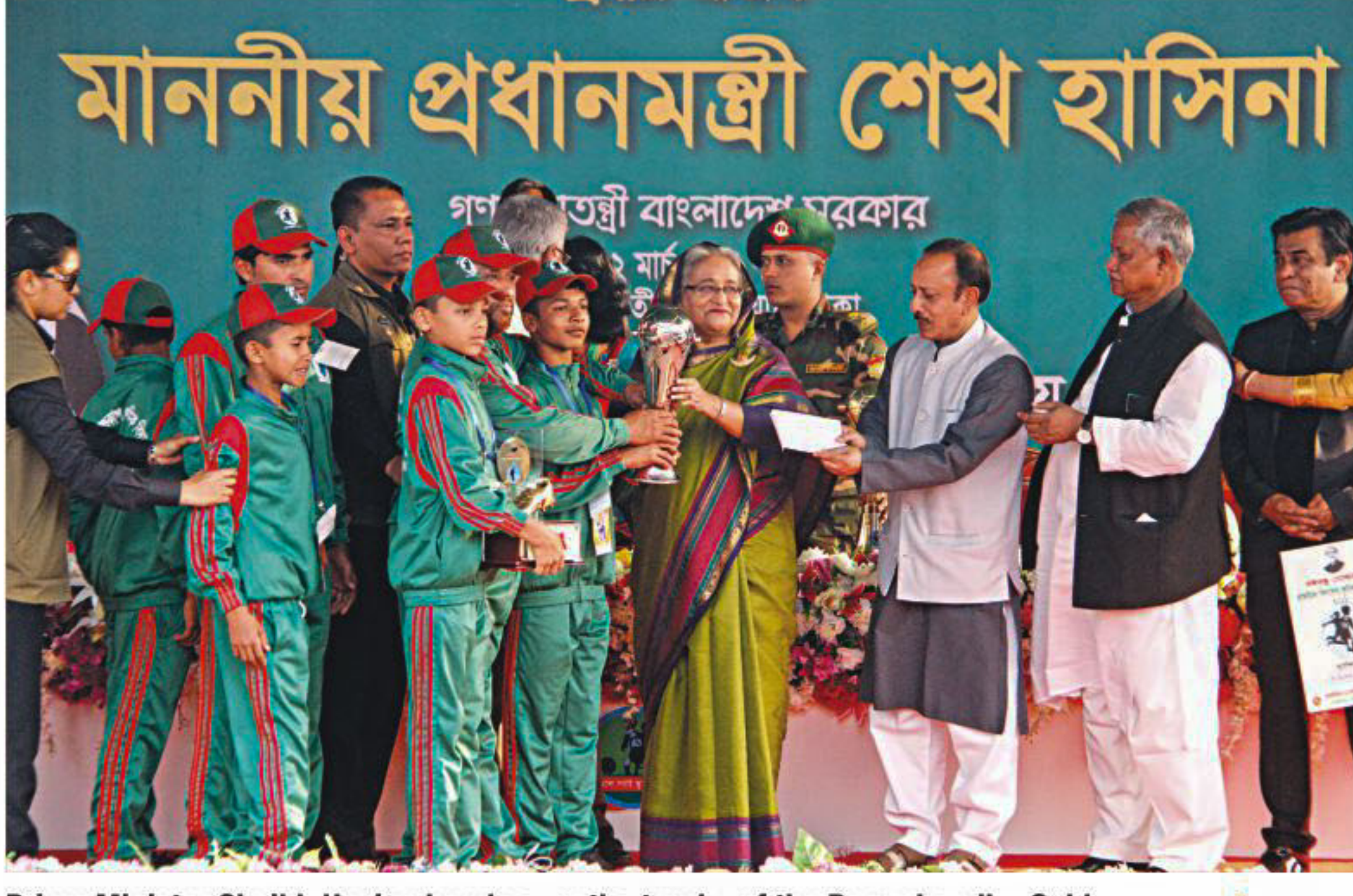
Prime Minister Sheikh Hasina hands over the trophy of the Bangabandhu Gold Cup to the Toitong Govt Primary School team at the Bangabandhu National Stadium yesterday.