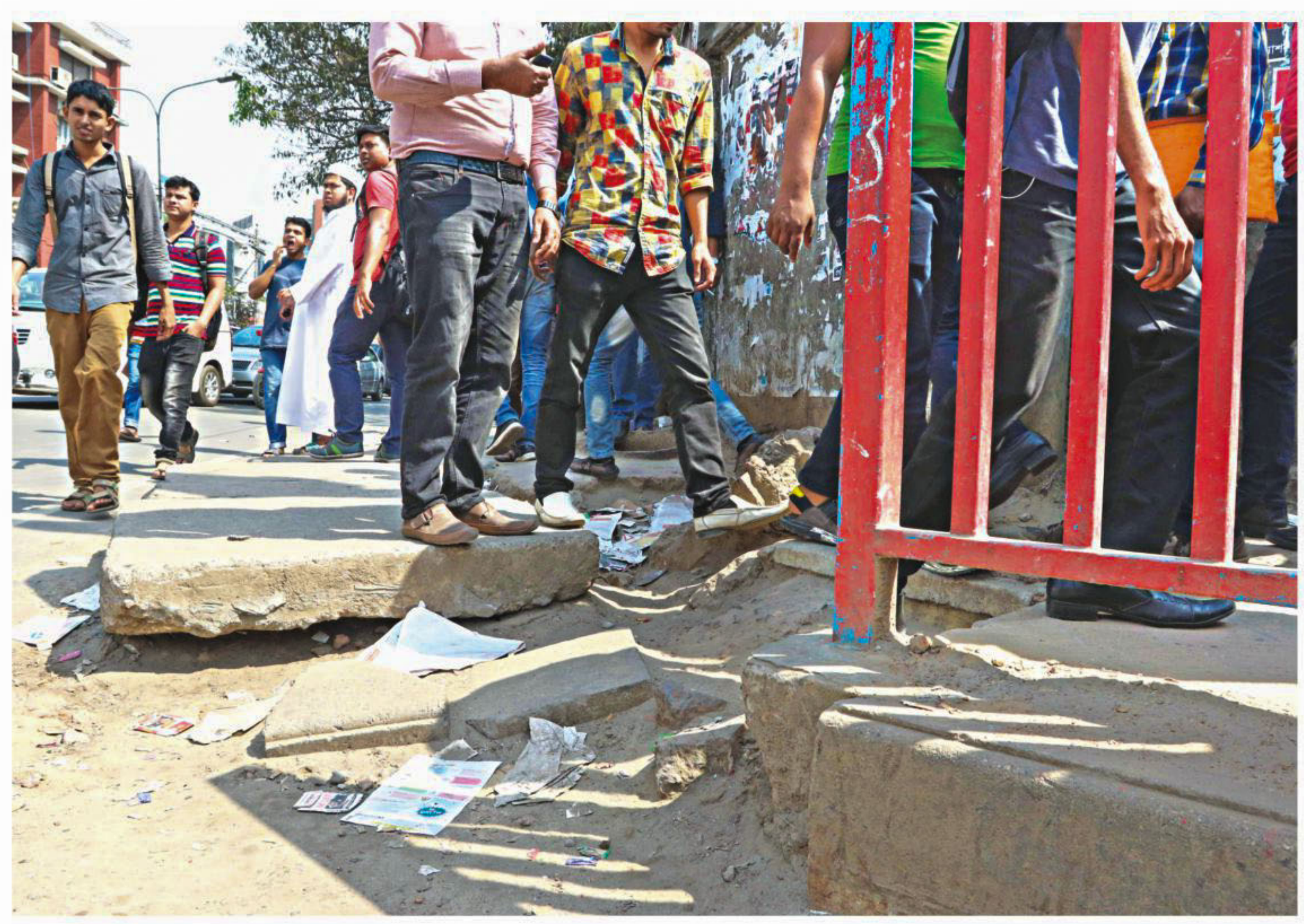
The footpath has remained broken at the intersection of Kamal Ataturk Avenue and the airport road at Kakoli for months, and there were reports that people injured themselves at this place. In an overpopulated and gridlocked Dhaka, many people take footpaths, sometimes for travelling long distances, but their safety is neglected here, too. The photo was taken Tuesday.