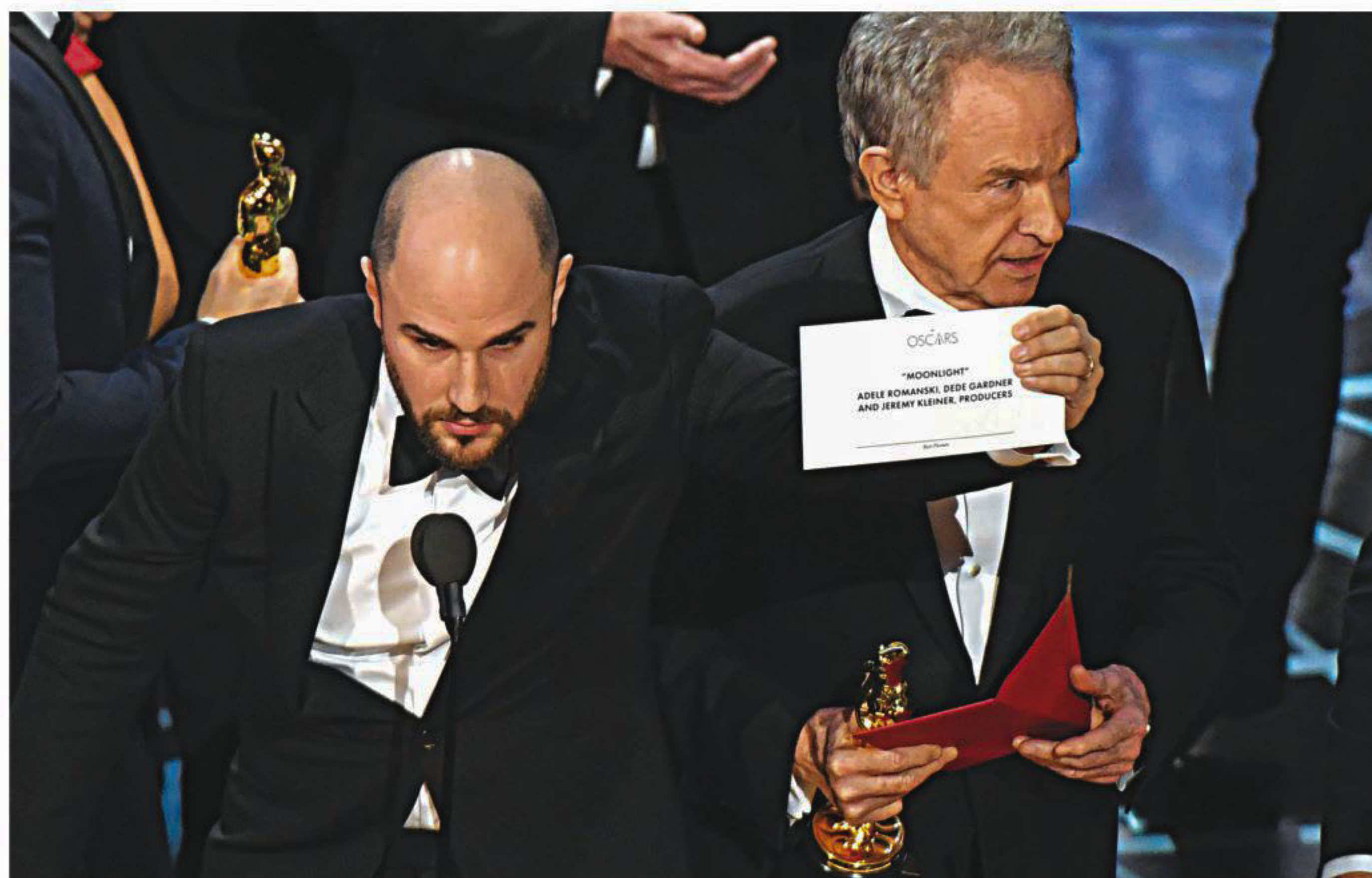
"La La Land" producer Jordan Horowitz, left, shows the card that reads "Best Film Moonlight" next to actor Warren Beatty after "La La Land" was mistakenly announced best film at the 89th Oscars.