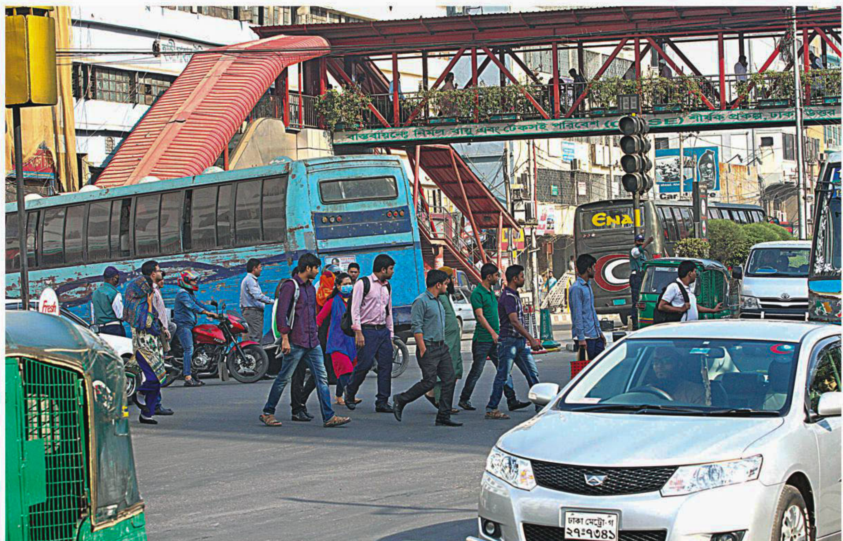
Pedestrians opt to dodge vehicles at speed and cross the Airport Road near Sainik Club in the capital yesterday. A footbridge with escalators is just yards away. It is the same situation at Kakoli intersection where there is another bridge. People even take children with them as they jaywalk.