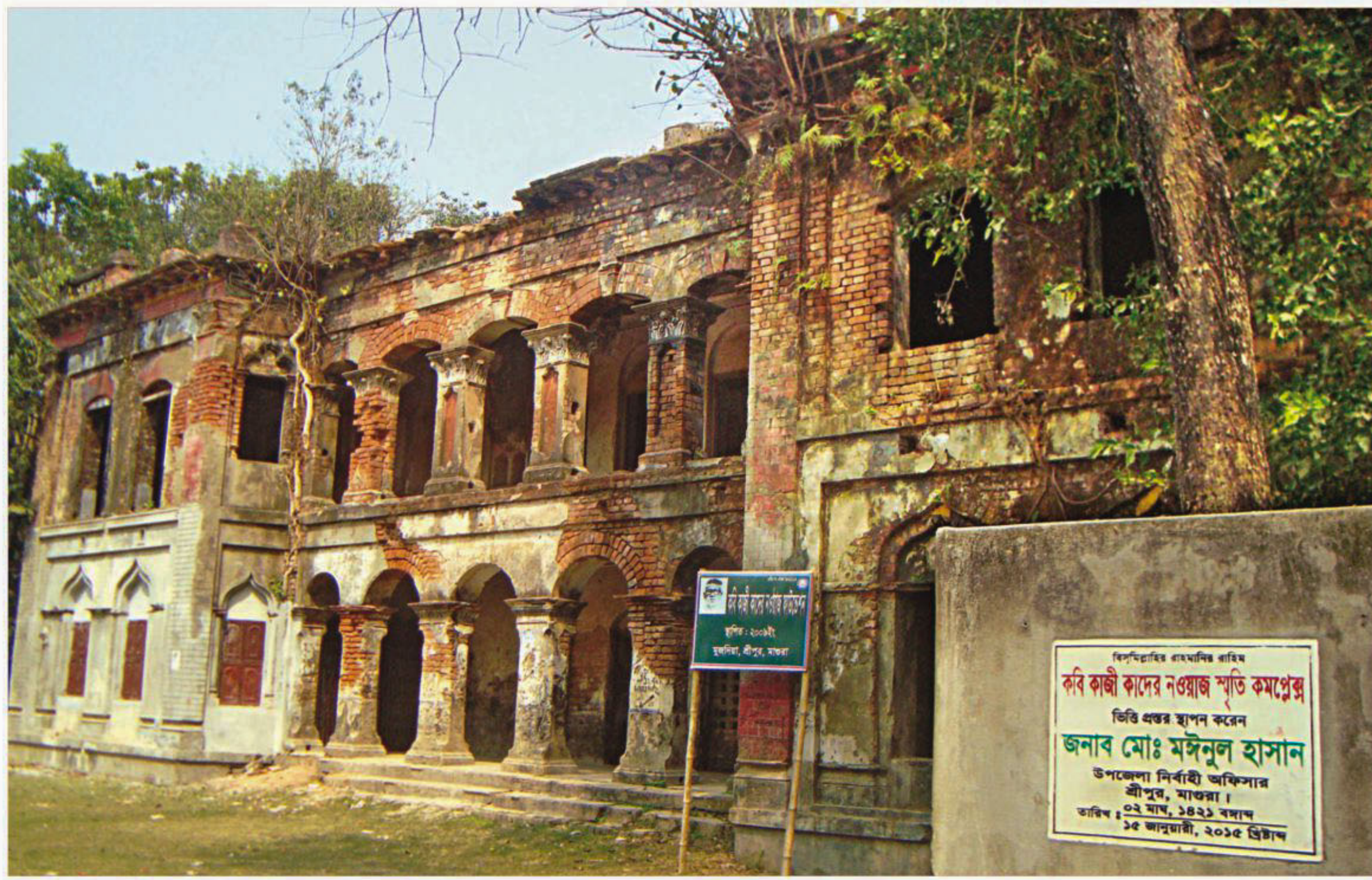
The dilapidated house of renowned Bengali litterateur Kazi Kader Newaj at Mujdia village of Sreepur upazila in Magura.