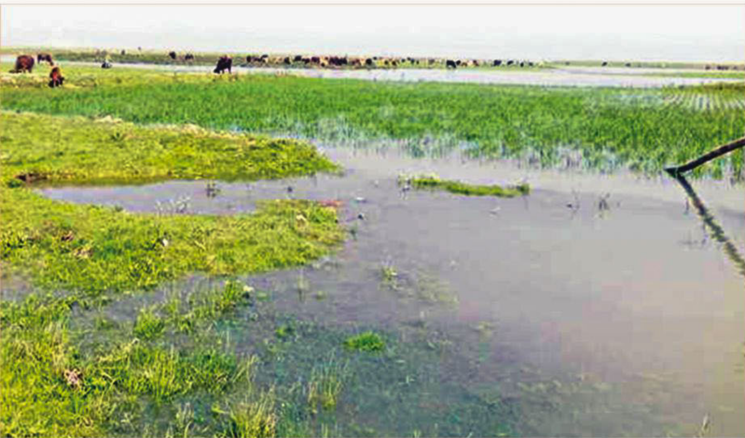
Onrush of water from the Dhonu river flooded 125 acres of cropland in Soitankhali haor area under Dharmapasha upazila of Sunamganj as the flood control embankment collapsed on Thursday night.

Advocate Emdadul Haque Millat, president of Communist Party of Bangladesh in Mymensingh, said Shahidullah deserves 'Ekushey Padak' for his contribution in the Language Movement.