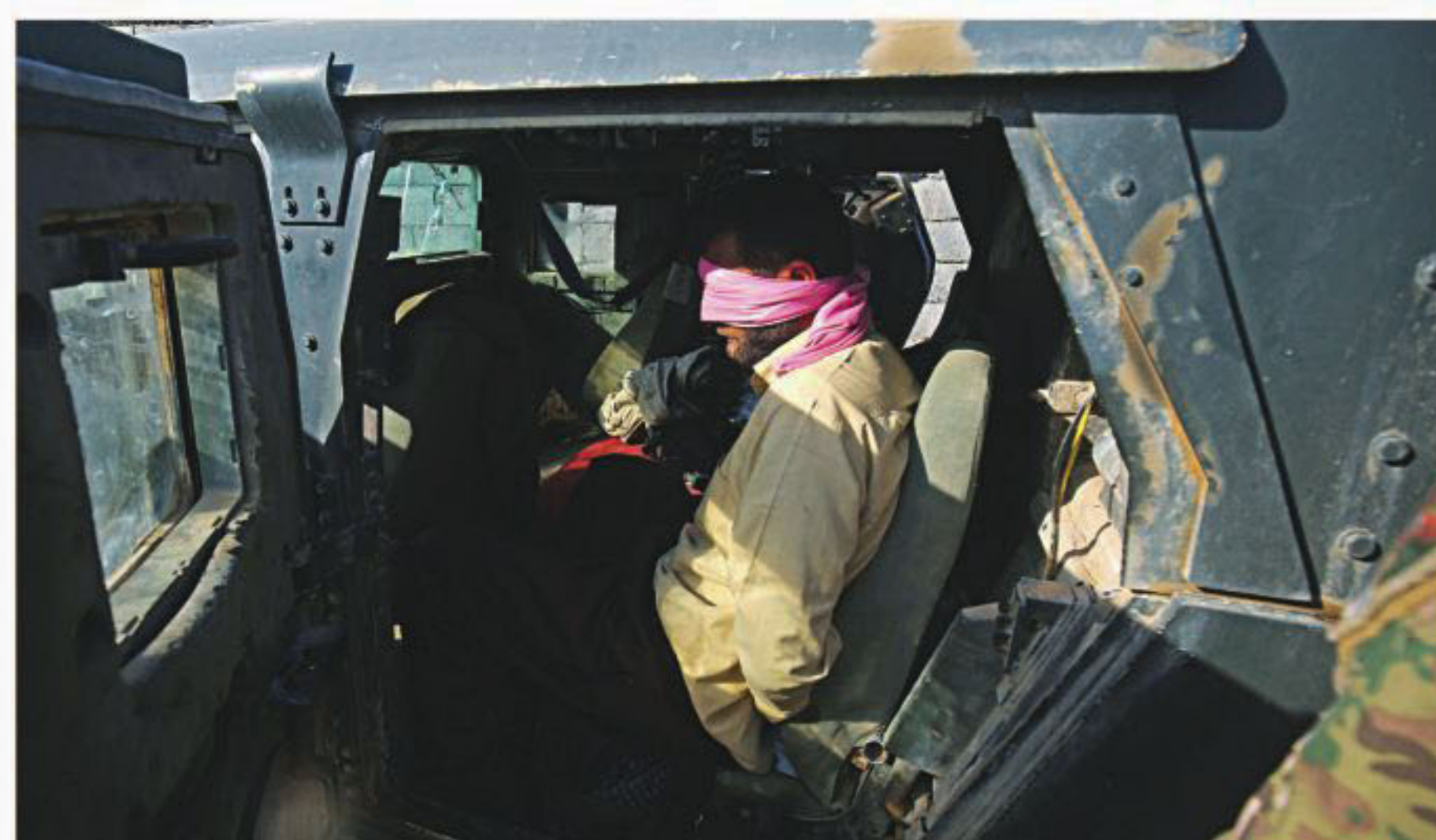
(From top, anti-clockwise) Displaced Iraqis flee their homes as Iraqi forces battle with Islamic State militants, in the district of Maamoun in western Mosul; troops advance towards Mosul's southern neighbourhood of Jawsaq; and an arrested man sits in an army vehicle in Jawsaq during the offensive. US-backed Iraqi forces yesterday pushed deeper into western Mosul yesterday after retaking the city's airport from Islamic State.