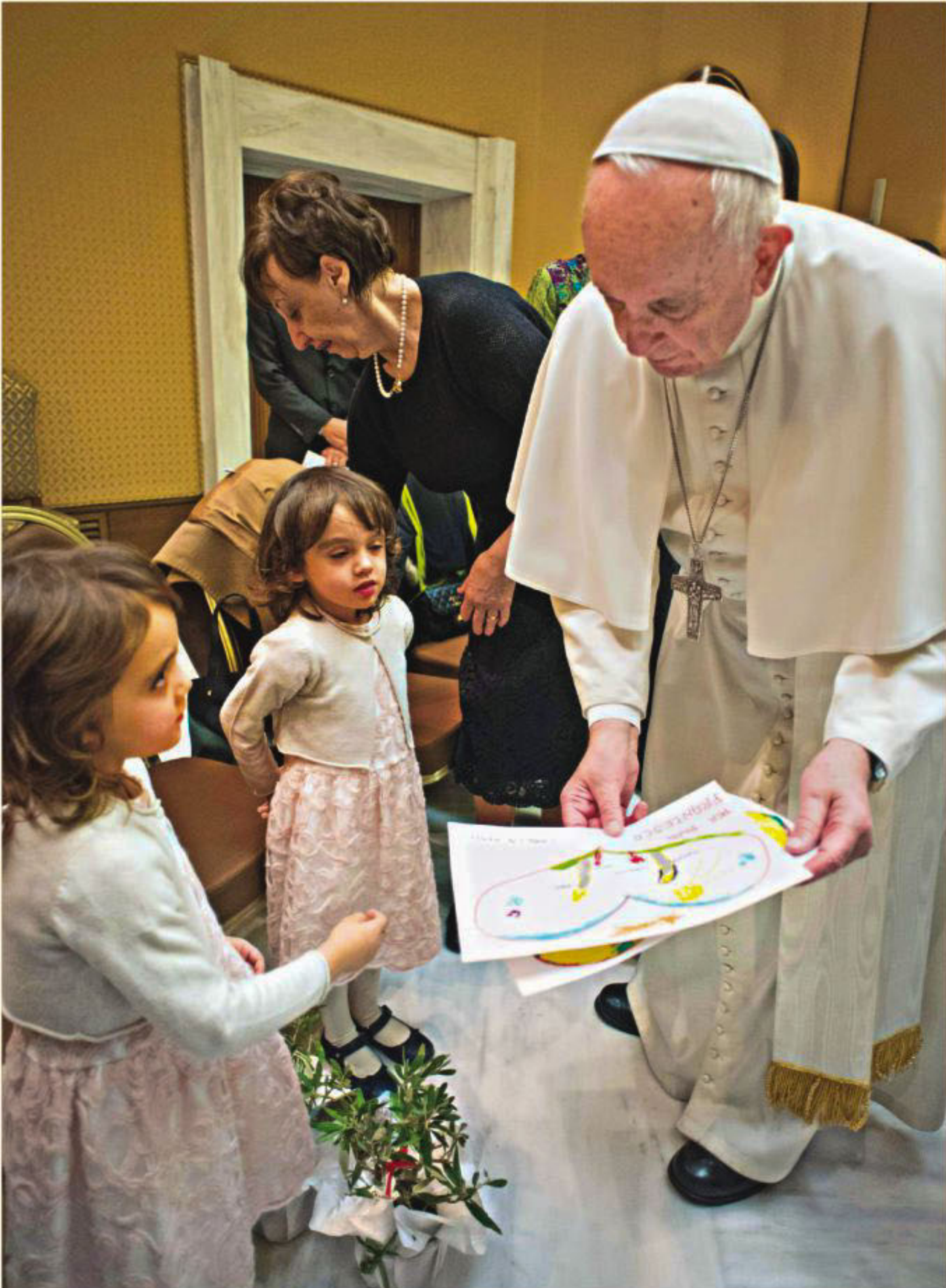
Two children showing Pope Francis a drawing as he meets the relatives of Gulshan attack victims during a private audience at the Vatican on Wednesday.