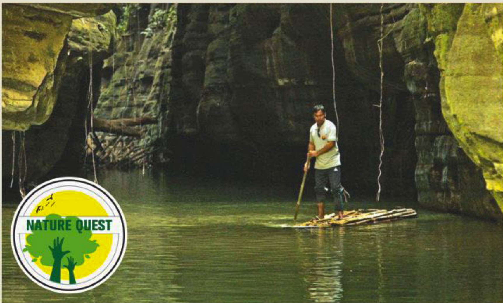
An explorer coming out of Runagchari cave in Bandarban's Thanchi upazila.