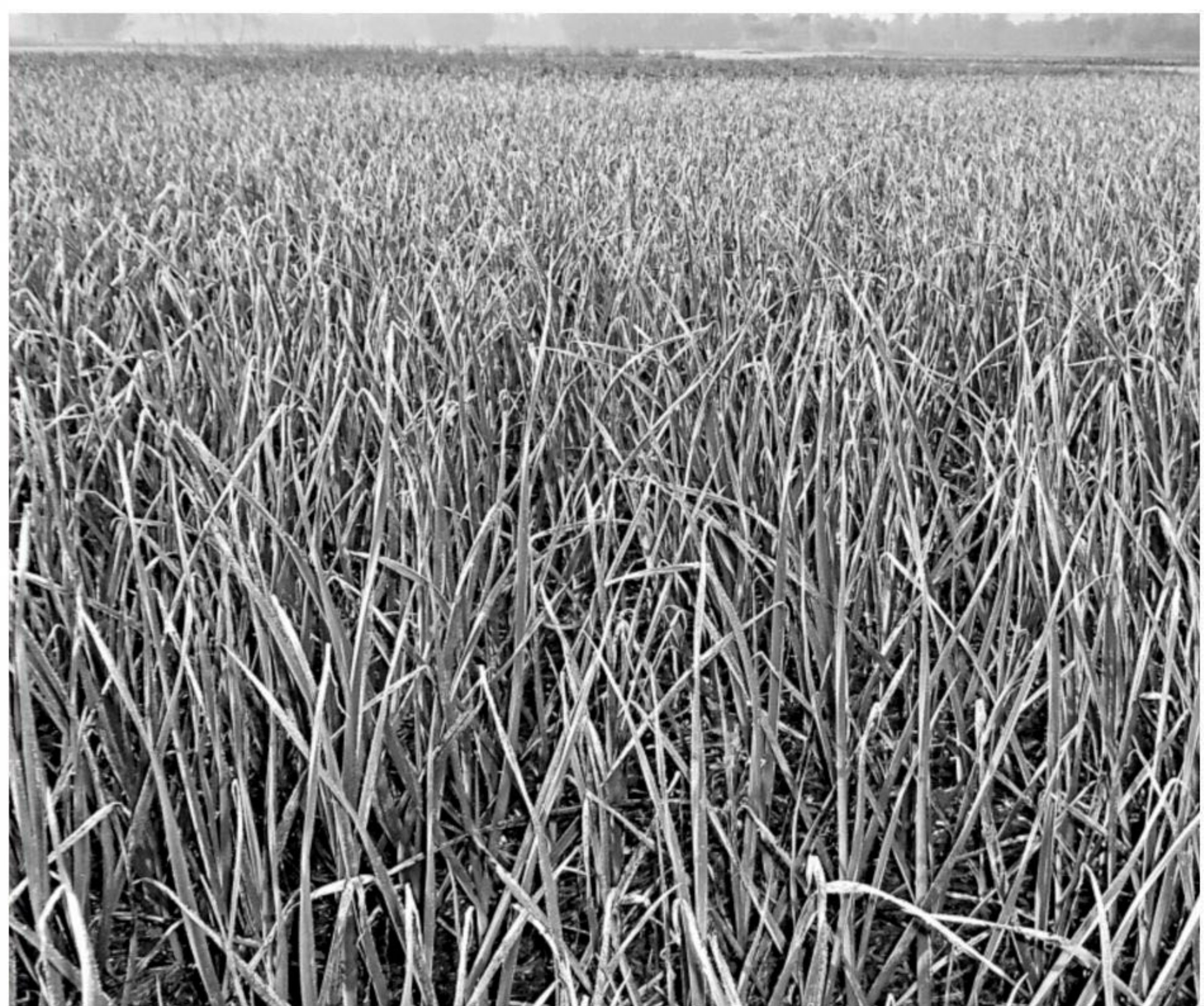
Farmers have cultivated garlic on vast areas in Kachinia village in Dinajpur's Khansama upazila, with a hope of bumper yield and fair price.