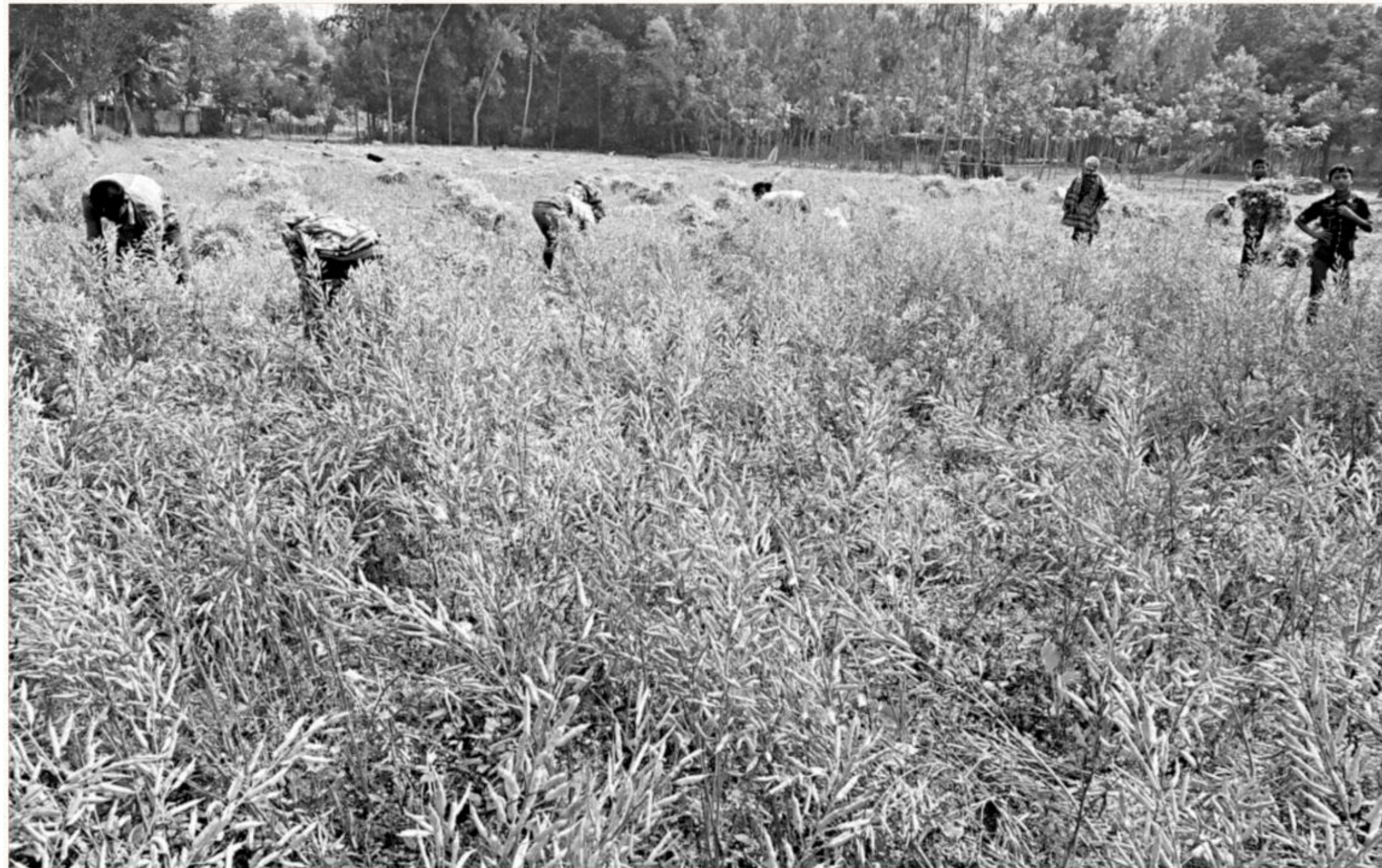
Mustard growers of Thakurgaon and Panchagarh are happy due to good production of the crop and fair prices in the markets. The picture was taken from Dakkhin Bathina village in Thakurgaon Sadar upazila on Sunday.

"This is an intermediate level college and we cannot take initiative to open degree classes unless and until we receive MPO," he added.