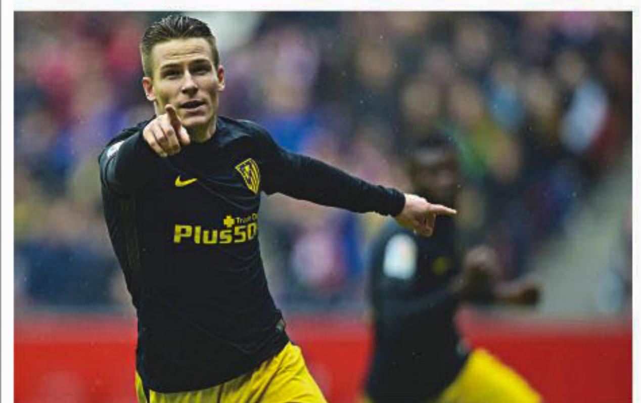
Atletico Madrid forward Kevin Gameiro scored the second fastest hat-trick in La Liga history against Sporting Gijon at the El Molinon Stadium yesterday.

His three goals came in just four minutes and 51 seconds, putting him second to David Villa in the overall standings.