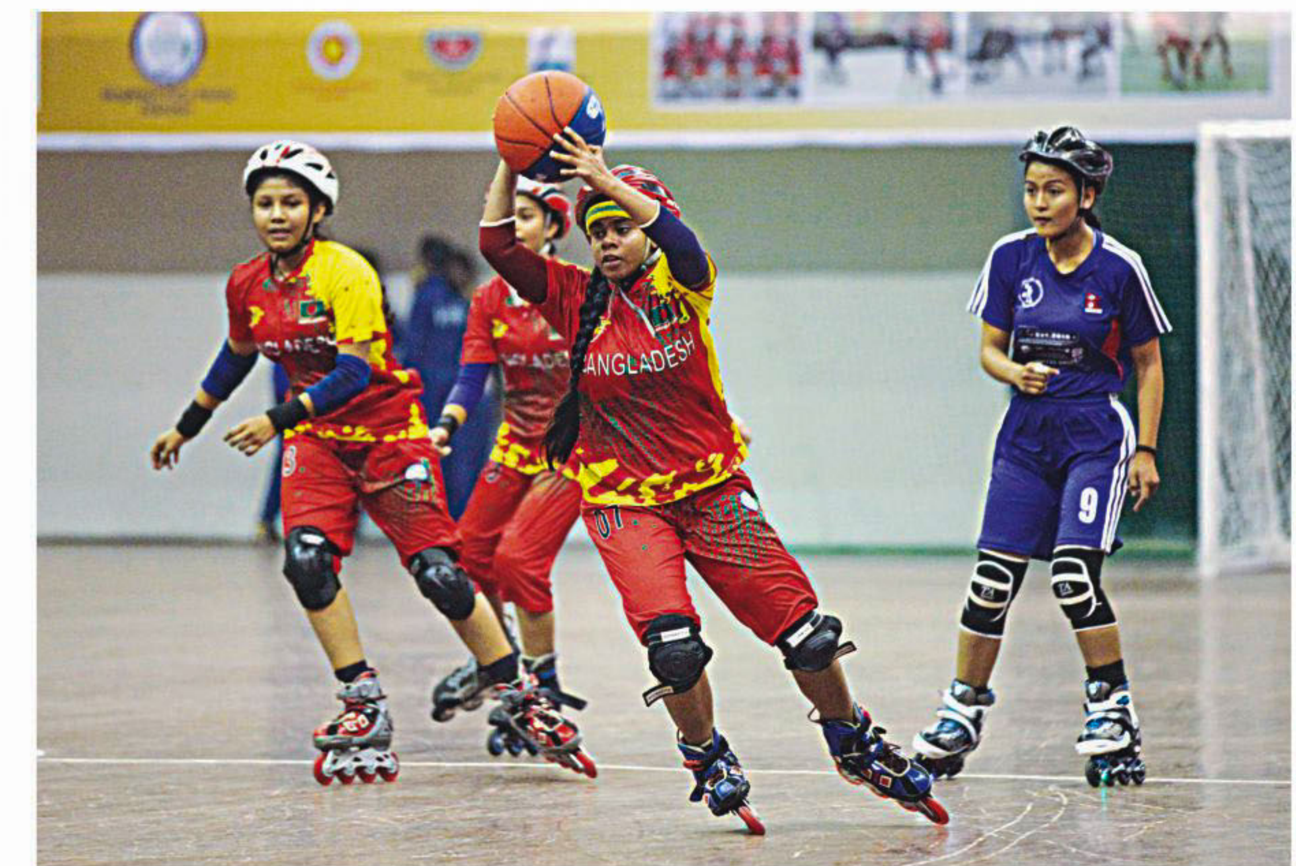
A Bangladesh player dribbles with the ball during a women's game of the 4th Roll Ball World Cup against Nepal at the Mirpur Indoor Stadium yesterday.

Gameiro was summoned from the bench just after the hour mark as Atletico upped the pressure in search for a winner.