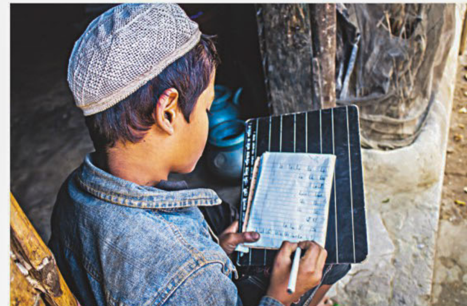
A Madrasa Student in Leda Camp