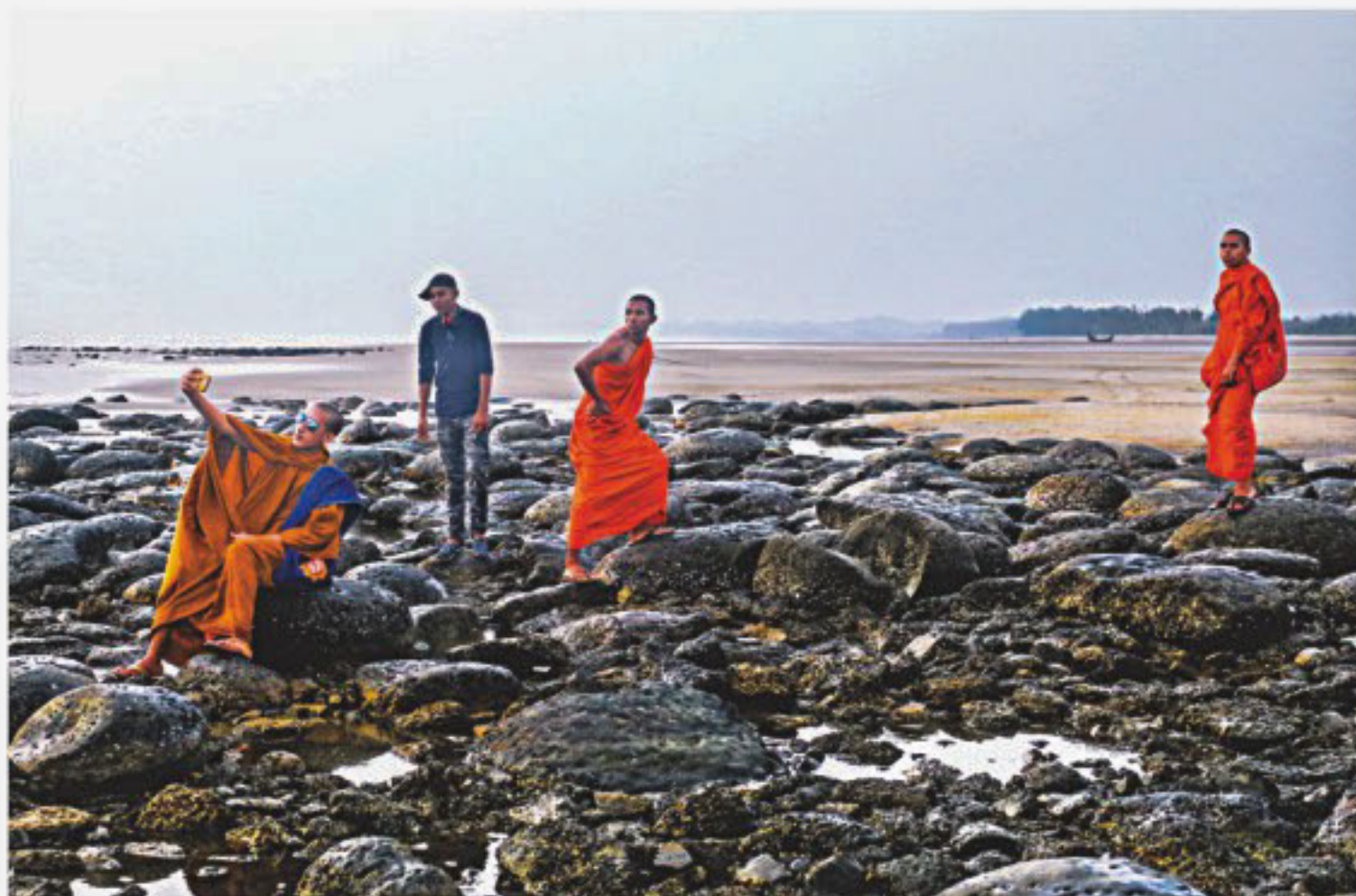
Cultural Diversity