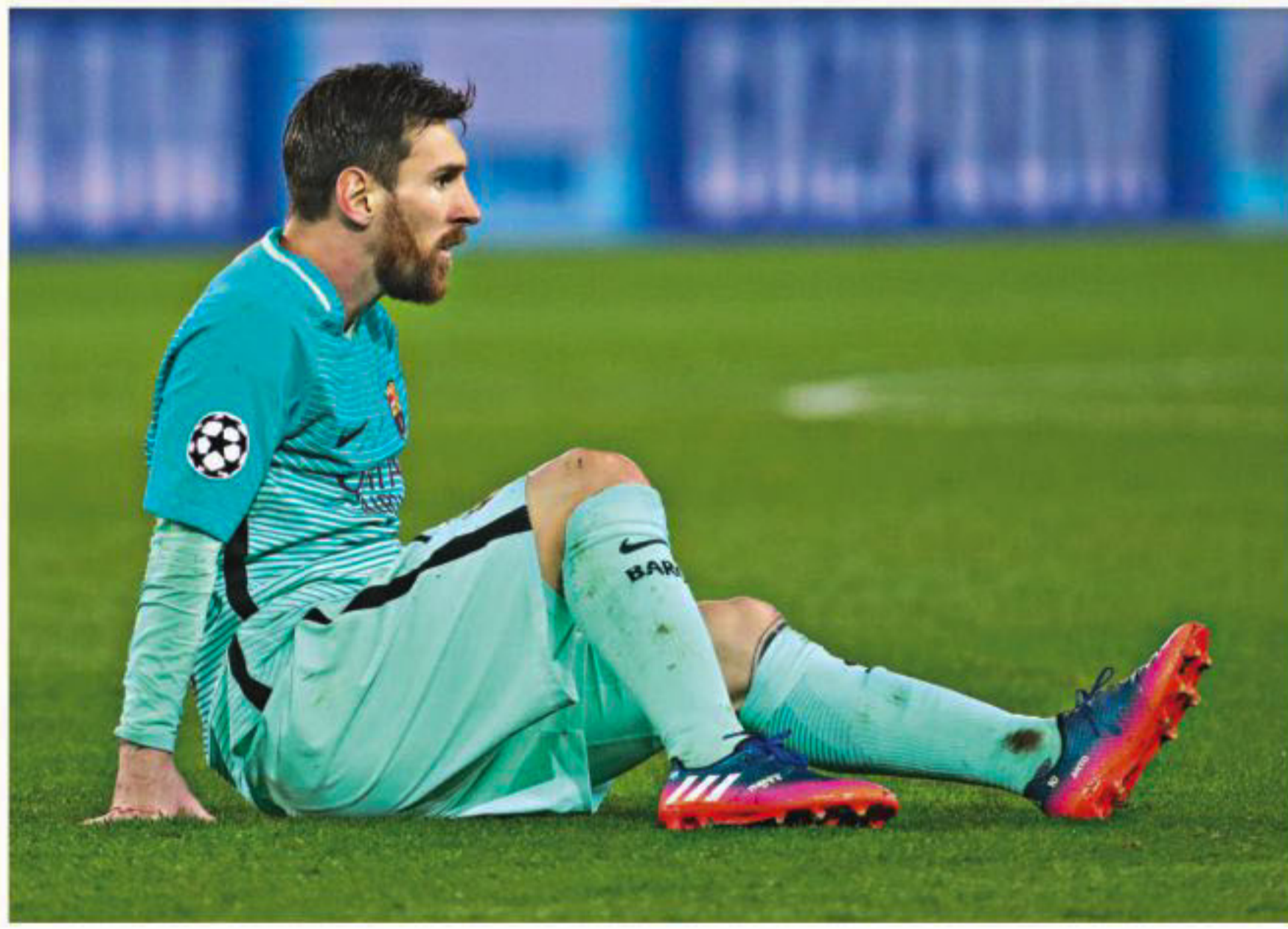
(L) Lionel Messi had a forgettable night in Paris, earning a two out of 10 according to a L'equipe rating, while his teammates didn't fare much better either as Barcelona were flattened to a 4-0 defeat by Paris Saint Germain on Tuesday. (R) The PSG players are ecstatic though with their remarkable feat.

Unsurprisingly, PSG's stars scored very highly after a sensational performance. Man of the match Angel Di Maria was given a nine after scoring twice, along with Adrien Rabiot. Fellow goalscorers Edinson Cavani and Julian Draxler scored 8/10.