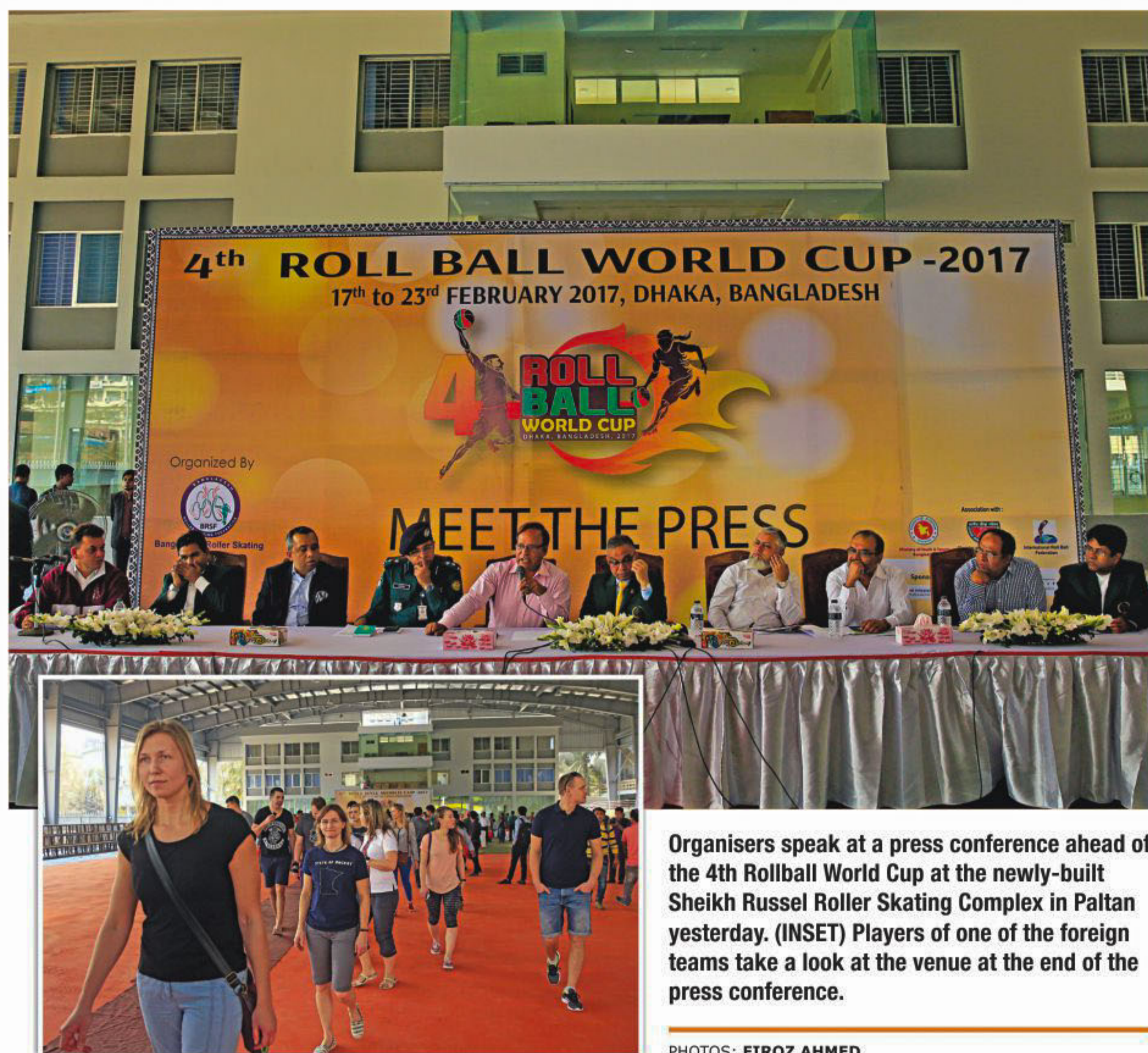
Organisers speak at a press conference ahead of the 4th Rollball World Cup at the newly-built Sheikh Russel Roller Skating Complex in Paltan yesterday. (INSET) Players of one of the foreign teams take a look at the venue at the end of the press conference.