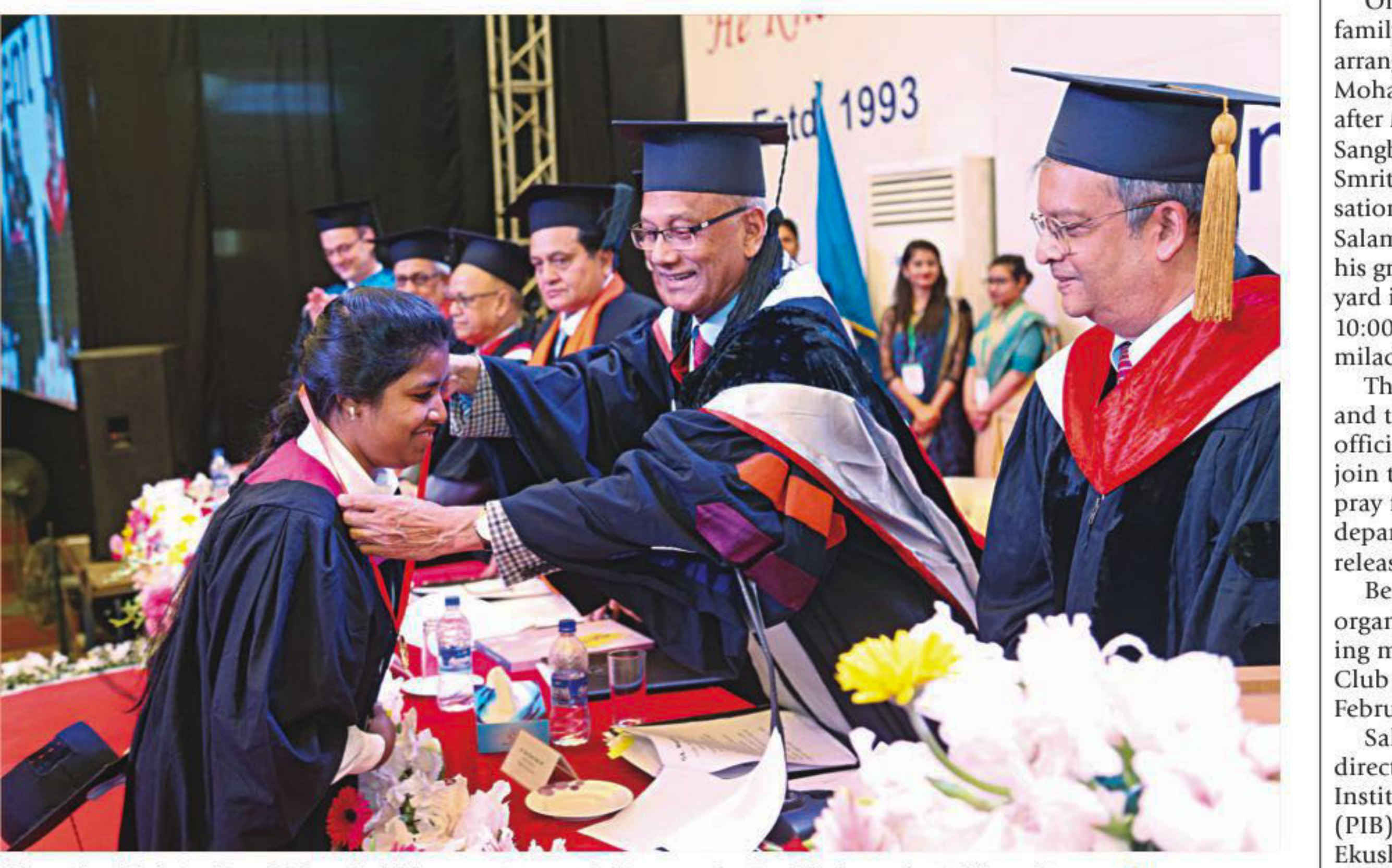
Education Minister Nurul Islam Nahid presents a medal to a graduate of Independent University, Bangladesh on the occasion of IUB's 18th convocation on its campus in Dhaka yesterday.