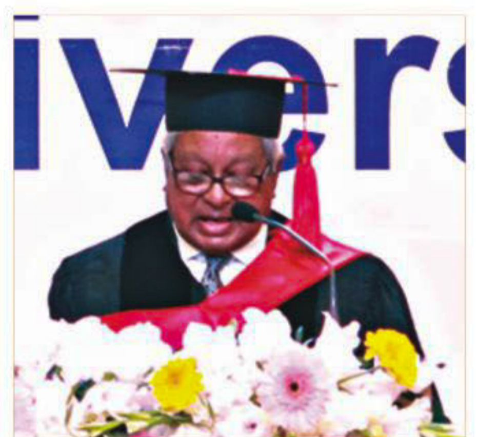
Sir Fazle Hasan Abed addressing as the convocation speaker.