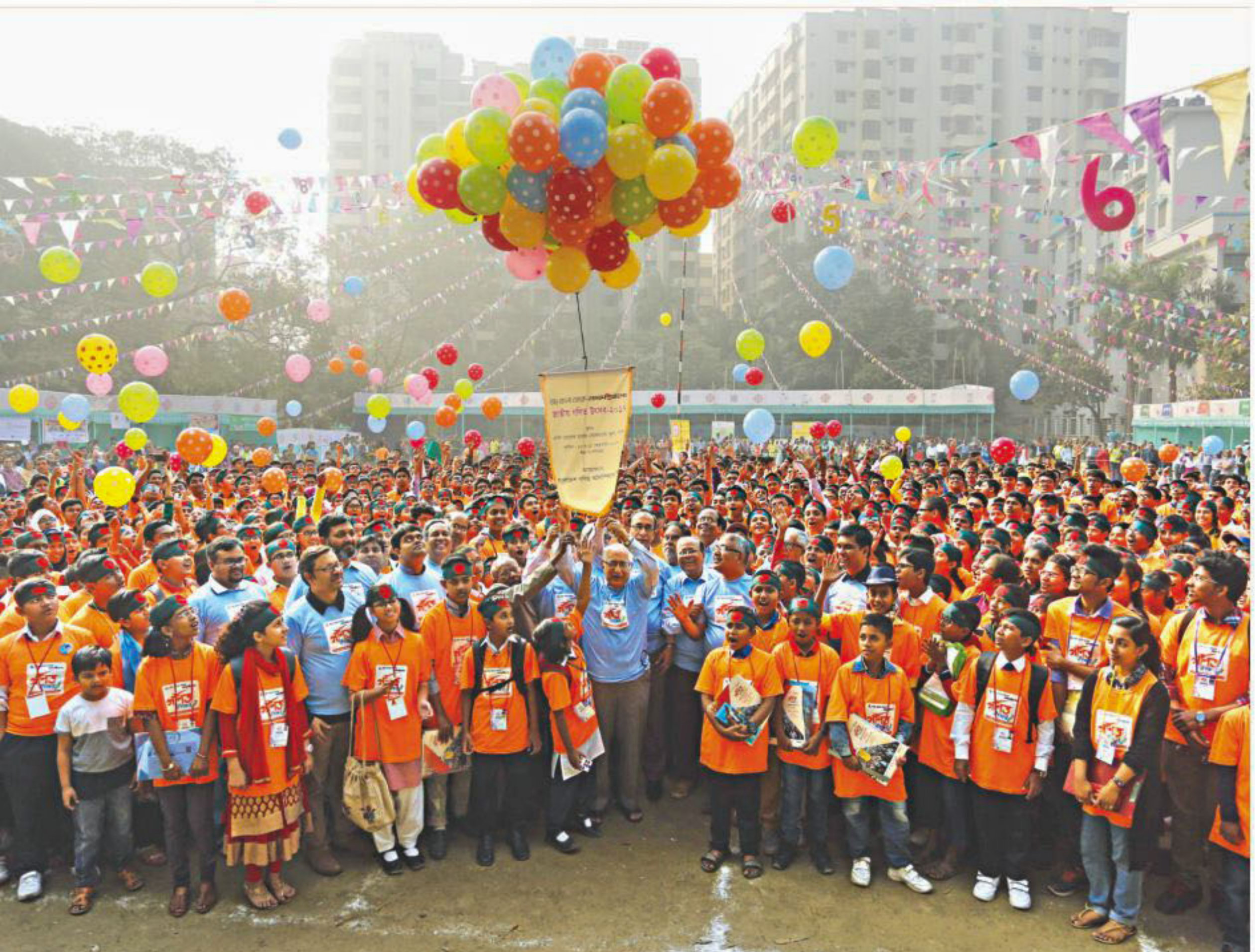
Students and guests release colourful balloons to inaugurate the 15th Bangladesh Mathematical Olympiad in the capital's St Joseph Higher Secondary School yesterday.

The celebration ended with a cultural programme in the evening.