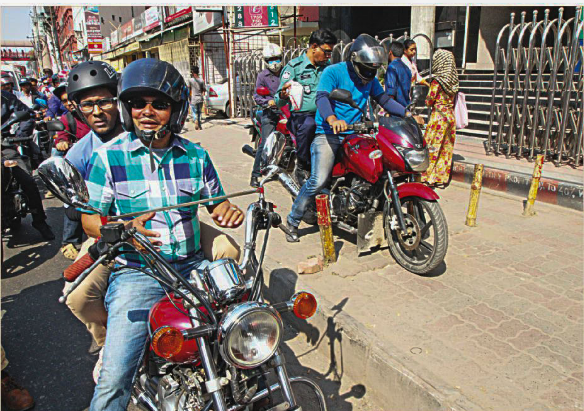
When most bikers wait at the traffic lights on Kazi Nazrul Islam Avenue in Karwan Bazar yesterday, two bikers, one of them carrying a policeman, get on the pavement and try to get through the polls installed there specifically to prevent motorcyclists from using the pavement.