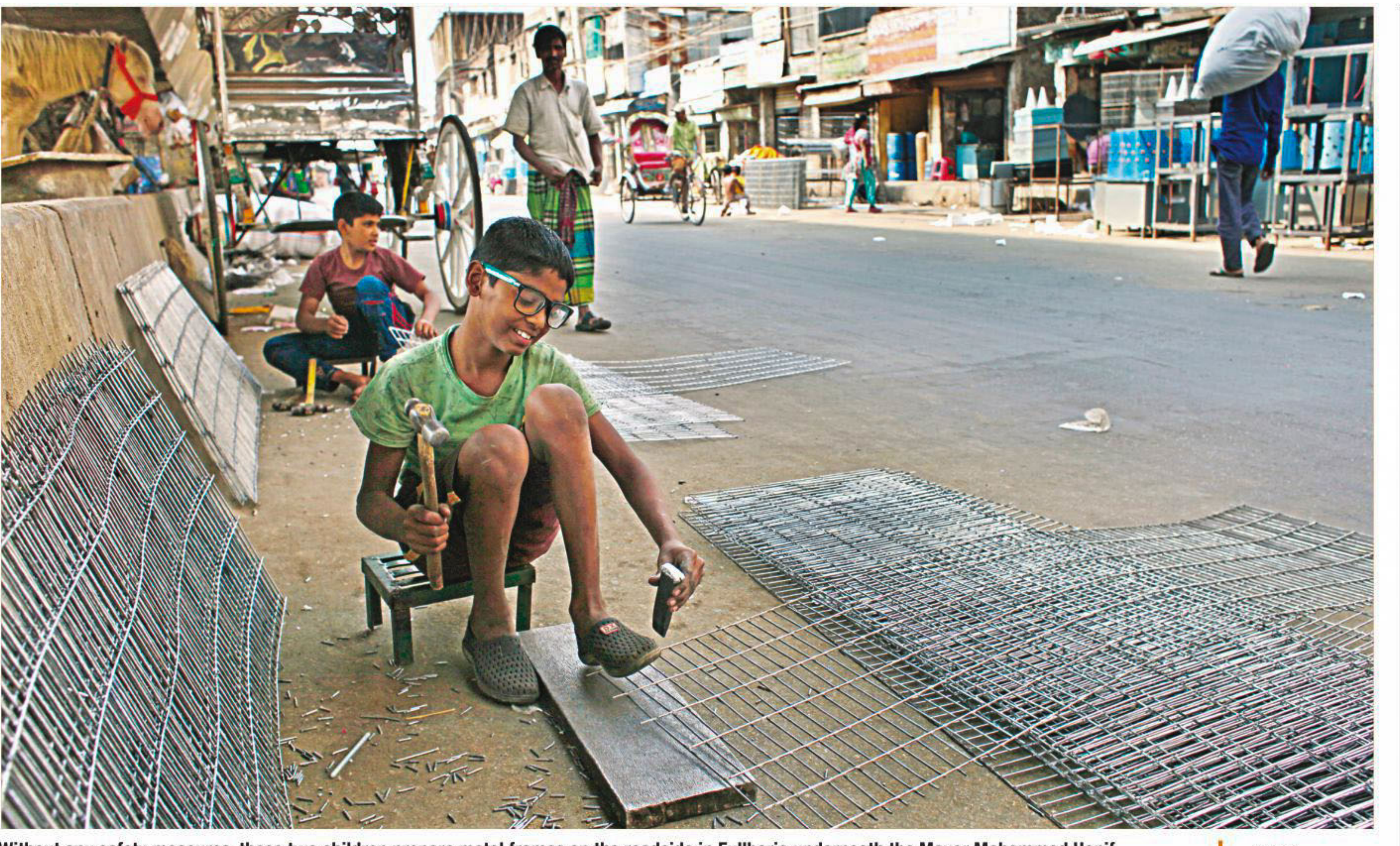
Without any safety measures, these two children prepare metal frames on the roadside in Fullbaria underneath the Mayor Mohammad Hanif Flyover. The duo, like many other children of their age, are involved in such risky jobs to make a living. The photo was taken recently.