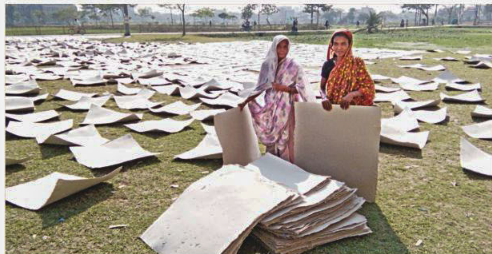
Drying of hard papers serves as the means of livelihood for these two widows, like a few others in the area. The photo was taken at a ground beside Shaheed Aktar Ali Moon Hall of Government Azizul Haque College in Bogra a couple of days ago.