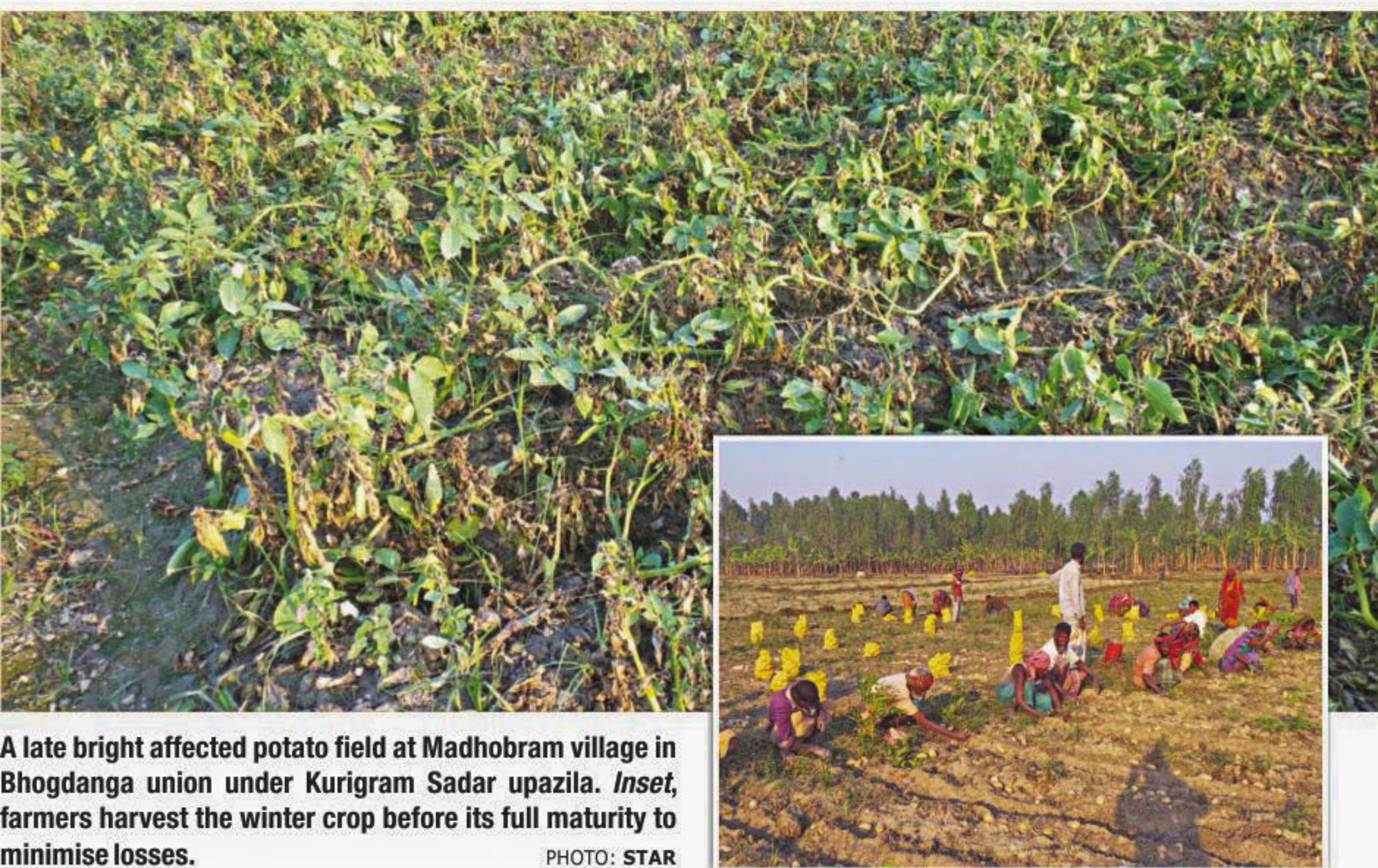
A late blight affected potato field at Madhobram village in Bhogdanga union under Kurigram Sadar upazila. Inset, farmers harvest the winter crop before its full maturity to minimise losses.