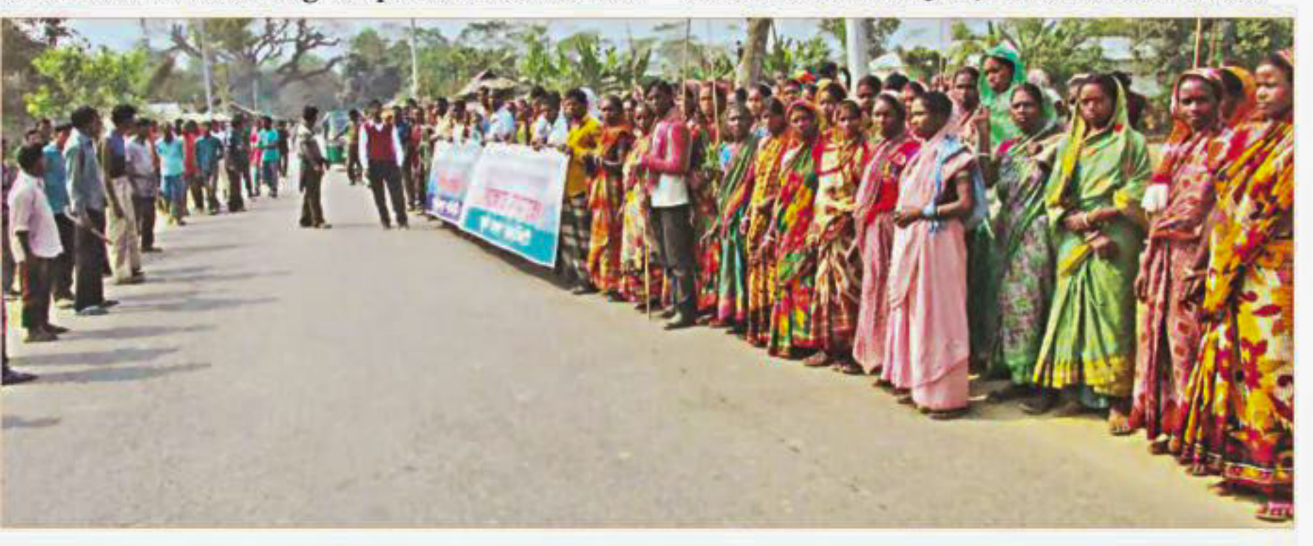
Workers of four tea gardens at a protest rally in Chandpur area of Chunarughat upazila in Habiganj yesterday.