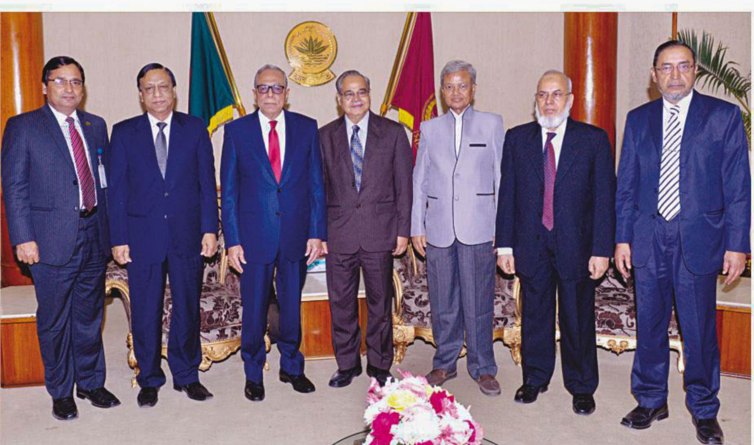
Outgoing Chief Election Commissioner (CEC) Kazi Rakibuddin Ahmad along with other commissioners pays a farewell call on President Abdul Hamid at the latter's office yesterday.

In addition, they spoke with Petrobangla officials who had assured them of taking necessary measures to remedy the situation.