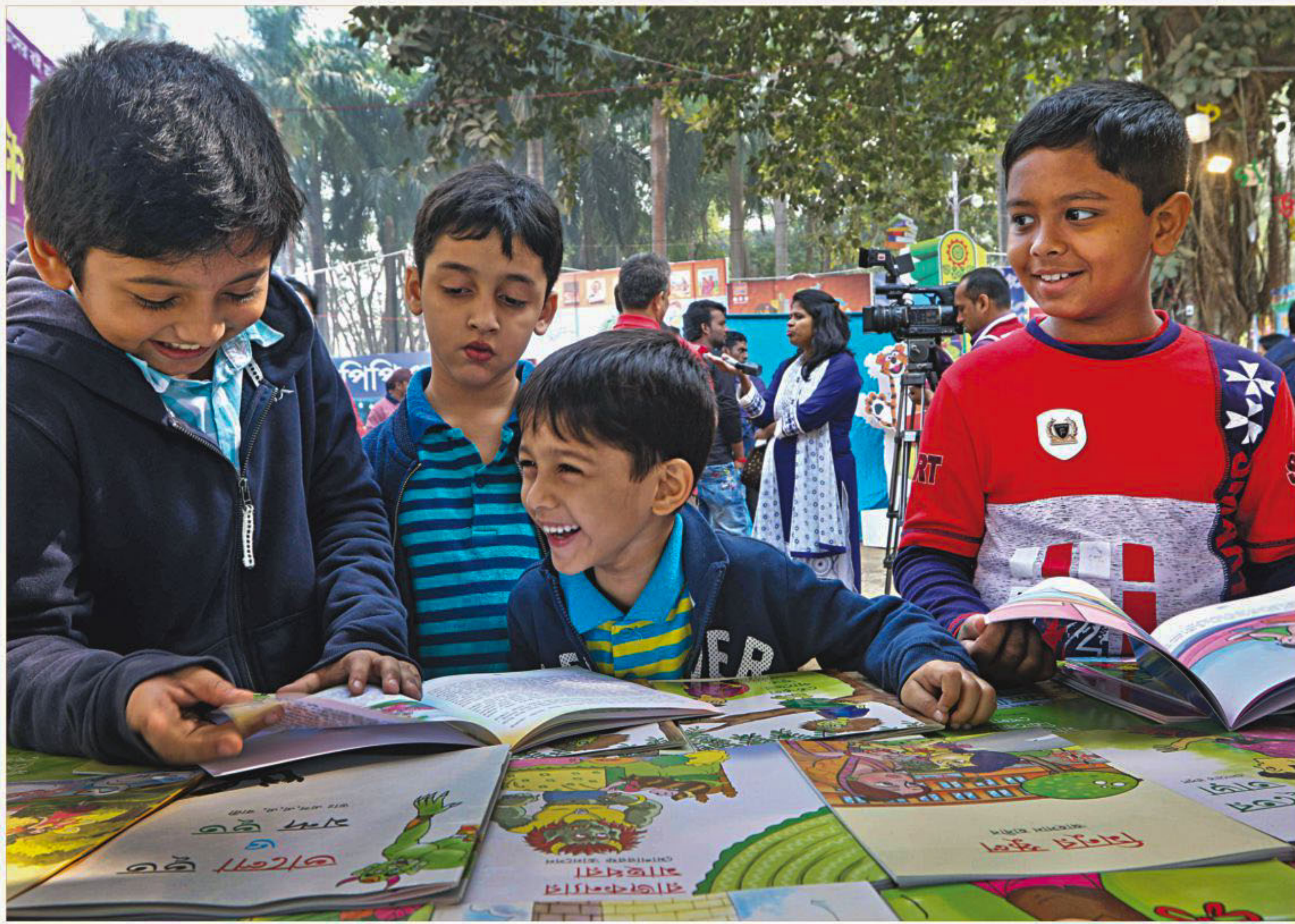
Kids have fun while browsing books at an Ekushey Boi Mela stall on Bangla Academy premises during "Shishu Prahar" yesterday. "Shishu Prahar" is part of the day, from 11:00am to 1:00pm, dedicated to children.