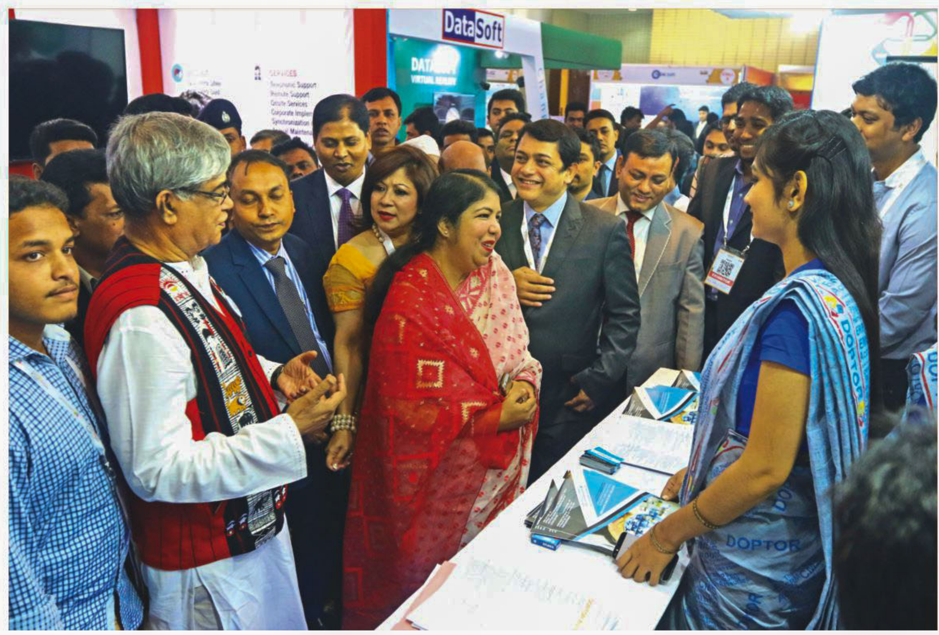
Parliament Speaker Shirin Sharmin Chaudhury visits a stall at the four-day Basis SoftExpo in Dhaka yesterday. Some 140 local companies are taking part in the fair organised by Bangladesh Association of Software and Information Services at Bangabandhu International Conference Centre.