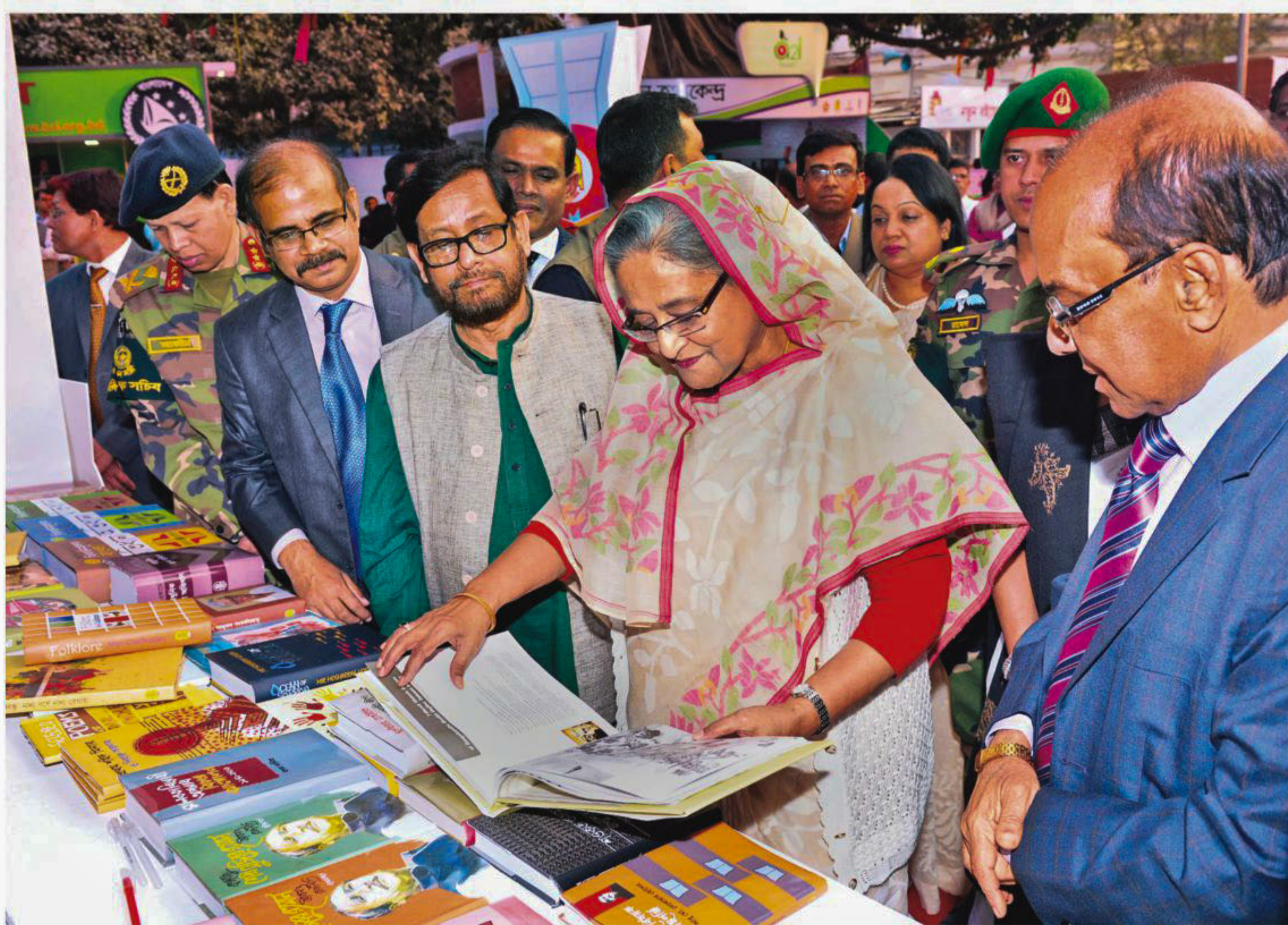
Prime Minister Sheikh Hasina flipping through the pages of a book after inaugurating the month-long "Amar Ekushey Boi Mela" and the three-day International Literature Conference on the Bangla Academy premises yesterday.