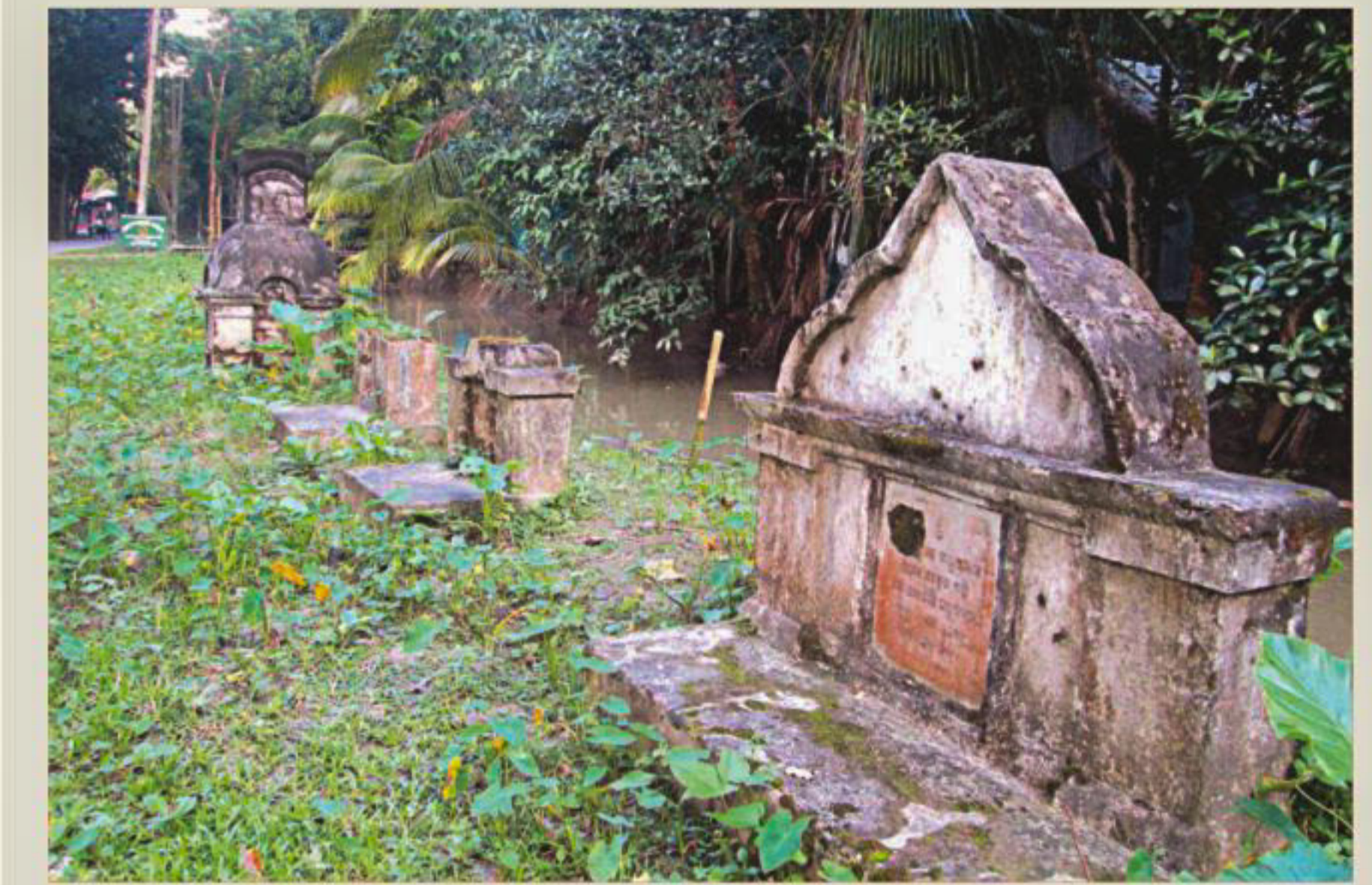
HISTORIC TOMBS IN RUINS: Five tombs with mortal remains of the victims of Satidaha, a long abandoned practice of burning Hindu widows with the bodies of their deceased husbands, lie in utter neglect in front of Ansar and VDP office at Kumarkhali in Pirojpur town.