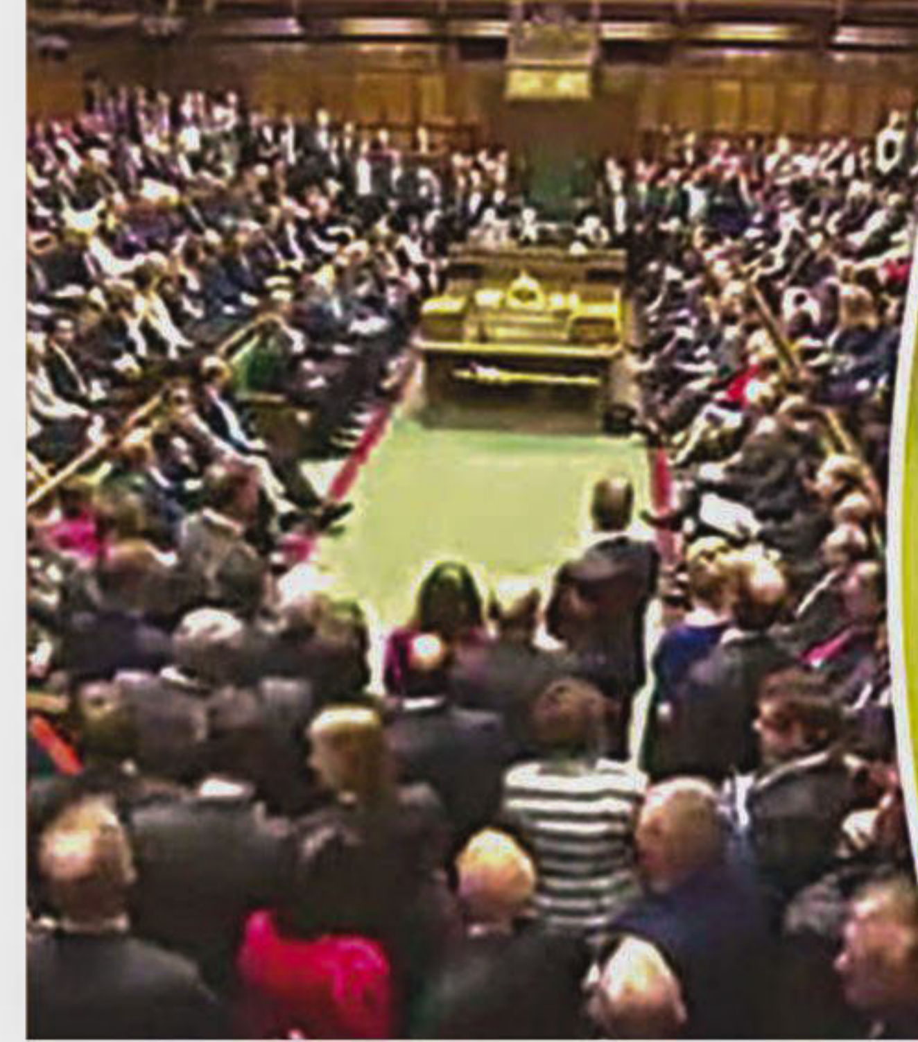
Taking a stand for the people.

Unfortunately they blindly support the party line in all issues, not only in casting votes. They think little about the people they represent. Take the example of a discussion on the proposed budget during which the ruling party MPs blindly supported all the proposals while the opposition MPs opposed all of them. They do not dare oppose the party line, fearing loss of the party high command's blessing they enjoy in politics.