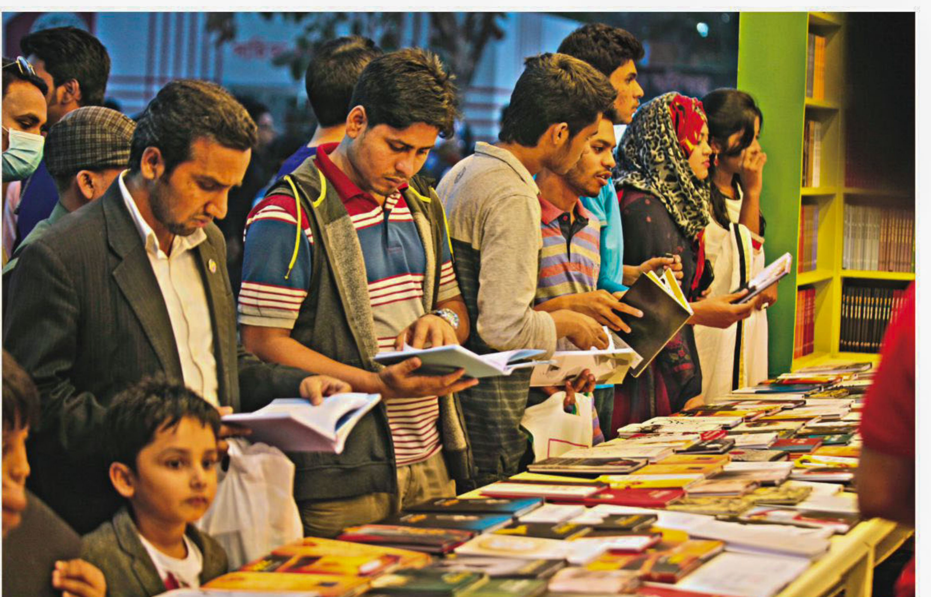
Young bookworms gather at a stall on the premises of Amar Ekushey Granthamela in Dhaka on the first day of the month-long book fair yesterday.

Inspector General of Police AKM Shahidul Hoque yesterday asked police members to help journalists perform their duties. "Journalists work for public and activities of the government or non-government organisations come to light through the media so we will have to support them perform their duties," the IGP said while talking to reporters at Ashulia Kobirpur in Savar on the outskirts of the capital. When asked about the recent assault on the journalists, he said those responsible will be given departmental punishment. Earlier, he joined the inaugural ceremony of "Kobirpur Range" as the chief guest.