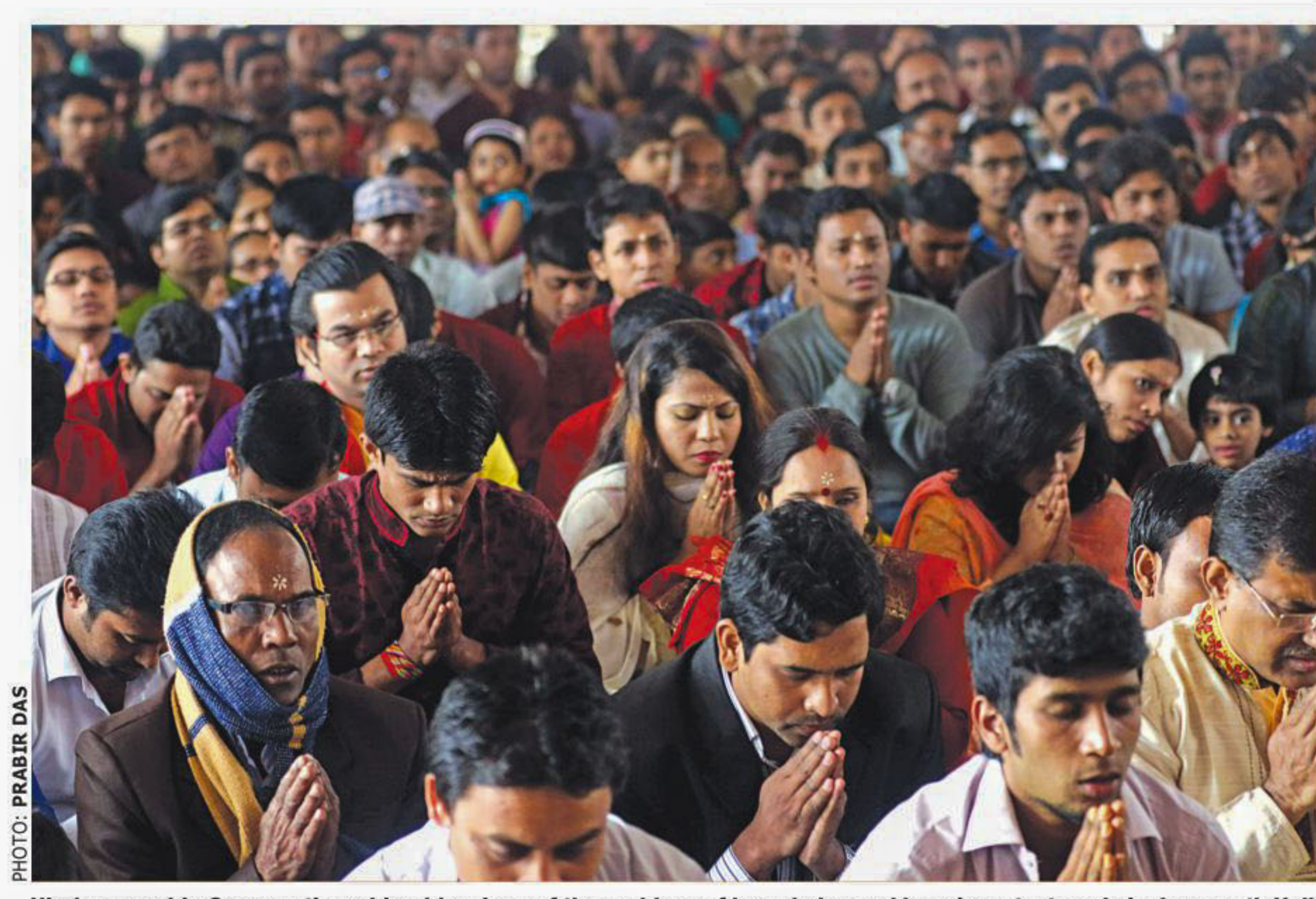
Hindus worship Saraswati, seeking blessings of the goddess of knowledge and learning, at a temple in Jagannath Hall at Dhaka University, on the occasion of Saraswati Puja, which was also celebrated elsewhere in the country yesterday.