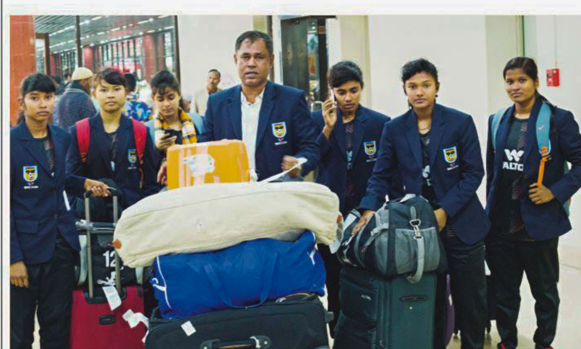
Bangladesh under-16 women's football team returned from Japan on Monday night after taking part in the J-Green Sakai Lady's Festival where they won three matches, lost two and drew the other two.