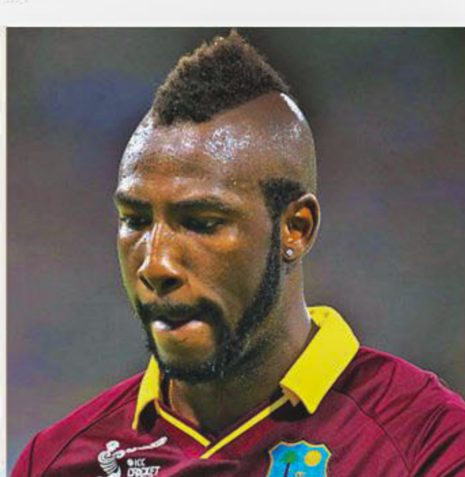
WADA rules state that athletes across all sports must inform their local anti-doping agencies where they will be for at least one hour each day to facilitate drug tests.

The 28-year-old Jamaican, who helped the West Indies win their second World T20 title in 2016, will be banned for a year from January 31.