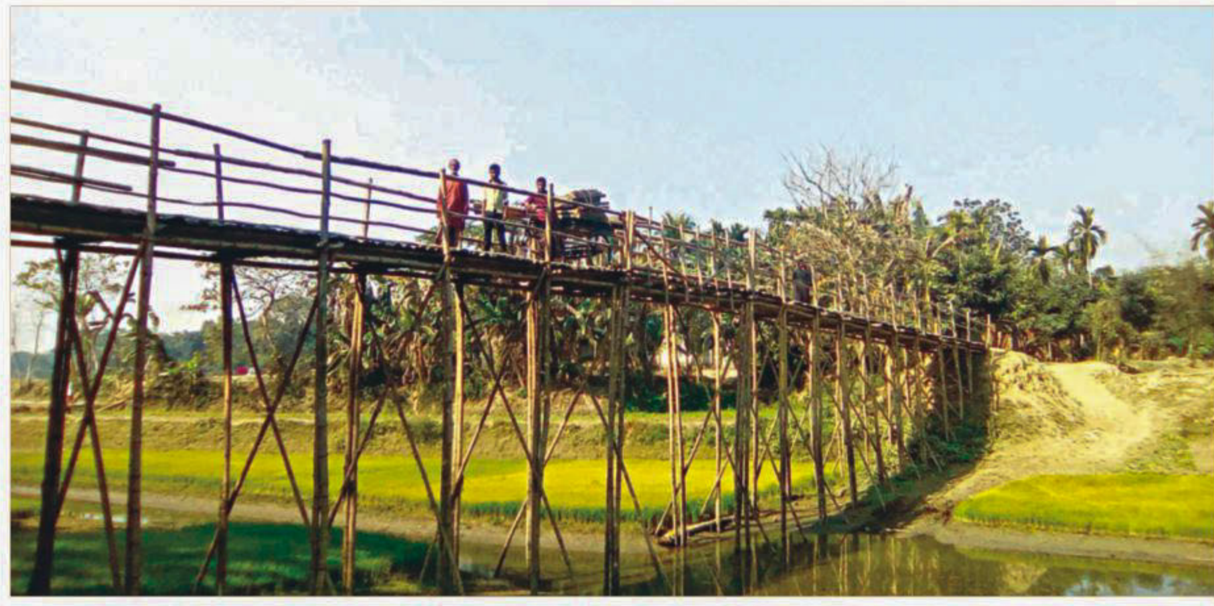
A rickshaw-van puller and two others cross a bamboo bridge on the Dhalai river in Tarakanda upazila of Mymensingh amid risk of accident.