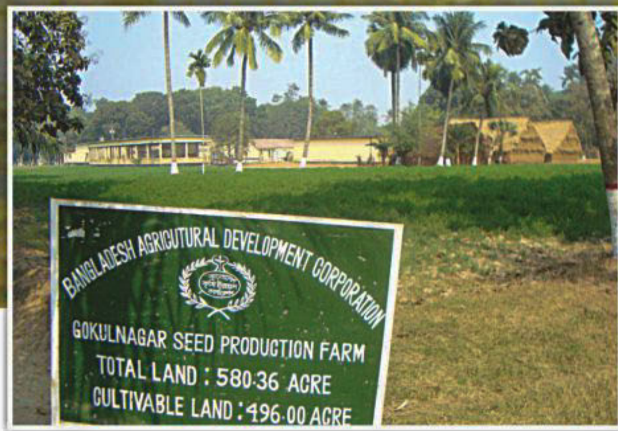
Farm labourers plant boro paddy at a field of Dattanagar farm in Moheshpur upazila of Jhenidah. Inset, the premises of Gokulnagar seed farm, one of the five plots under the project run by Bangladesh Agriculture Development Corporation.