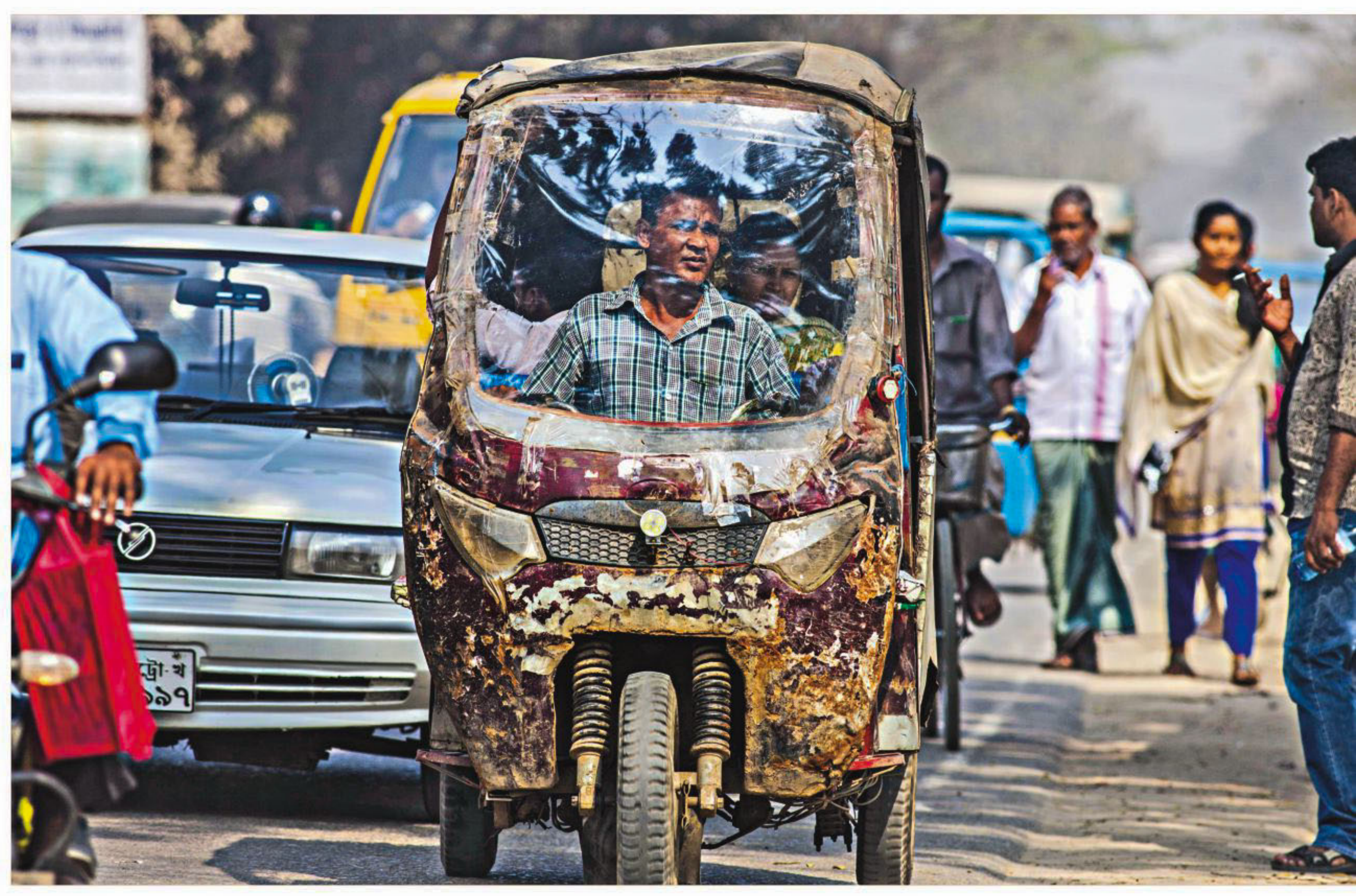
Bent and dented and with a duct-taped plastic sheet as windscreen, this illegal battery-run three-wheeler plies between Mohammadpur and Lalbagh in the capital. The photo was taken on Monday.

AGENCIES US President Donald Trump has fired the acting attorney general, a hold-over from the Obama administration, after she ordered Justice Department attorneys not to defend his controversial immigration orders. In a sharply worded statement, the White House called Sally Yates "weak on borders and very weak on illegal immigration" and also criticised Democrats for not yet confirming the appointment of attorney general-designate Jeff Sessions. "The acting attorney general, Sally Yates, has betrayed the Department of Justice by refusing to enforce a legal order designed to protect the citizens of the United States," the White House said in a statement. "This order was approved as to form and legality by the Department of Justice Office of Legal Counsel," it said. "Tonight, President Trump relieved Ms Yates of her duties." Federal prosecutor Dana Boente will serve as acting attorney general "until Senator Jeff Sessions is finally confirmed by the Senate, where he is being wrongly held up by Democrat senators for strictly political reasons," it said. OBAMA, EU CHIEF SLAM TRAVEL BAN -- PAGE 8 SEE PAGE 2 COL 2