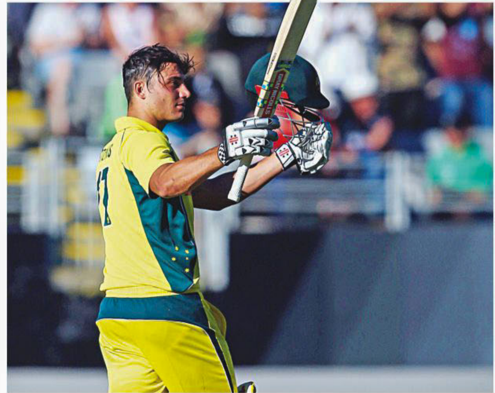
Marcus Stoinis of Australia celebrates his whirlwind century against New Zealand during the first ODI at Eden Park yesterday. Stoinis scored an unbeaten 146 runs off 117 balls but failed to win the match for his side.

Result: New Zealand won by 6 runs. Player-of-the-match: Marcus Stoinis.