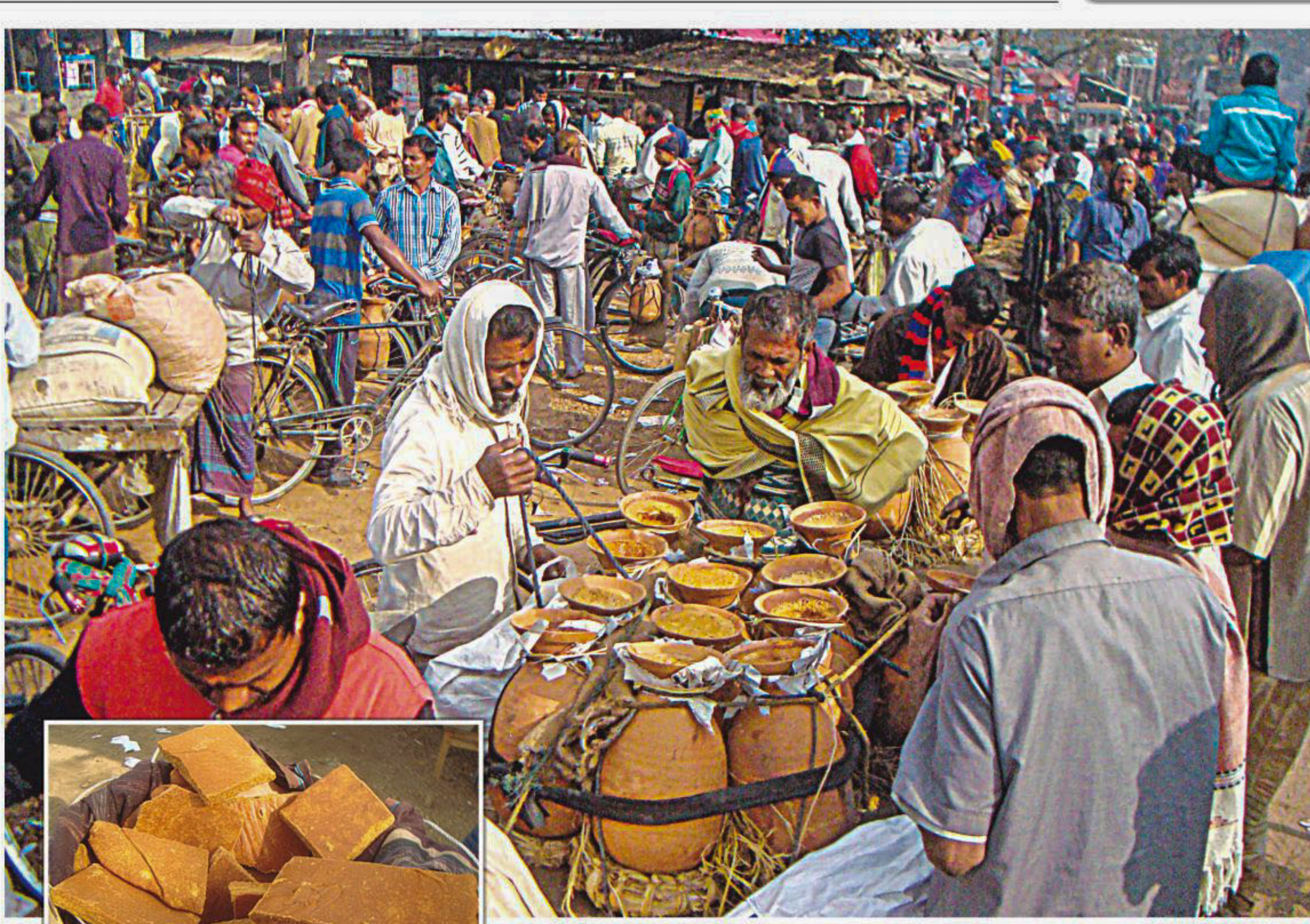
Earthen vessels of molasses being sold at Kaliganj Bazar of Jhenidah. Inset, solidified molasses, popularly known as patali gur, also being sold there. Good price of molasses is making gachhis, people who produce molasses, smile this year.