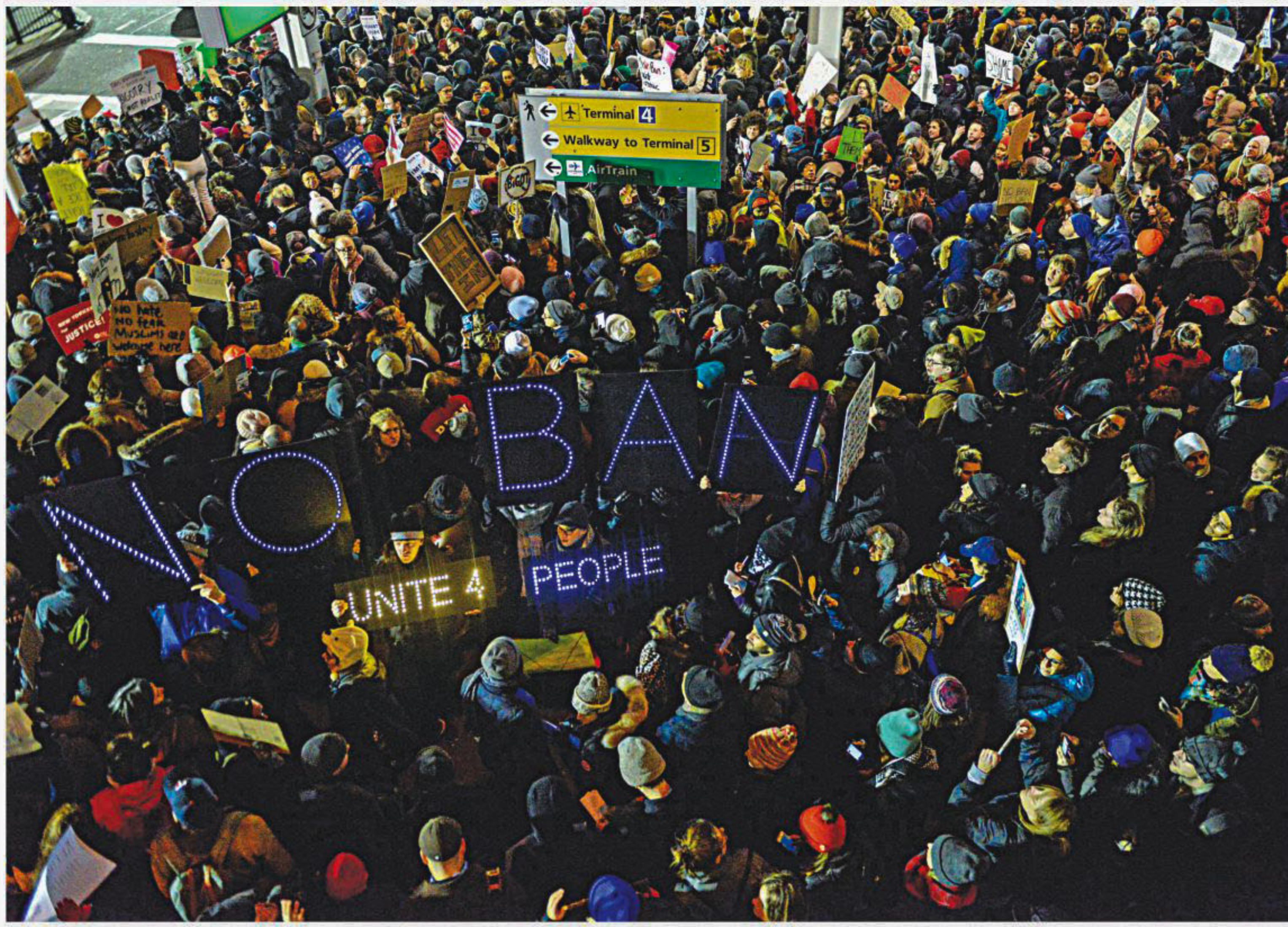
Protestors rally against the Muslim immigration ban at John F Kennedy International Airport in New York yesterday. President Trump signed the controversial executive order that halted refugees and residents, from predominantly Muslim countries, from entering the US.