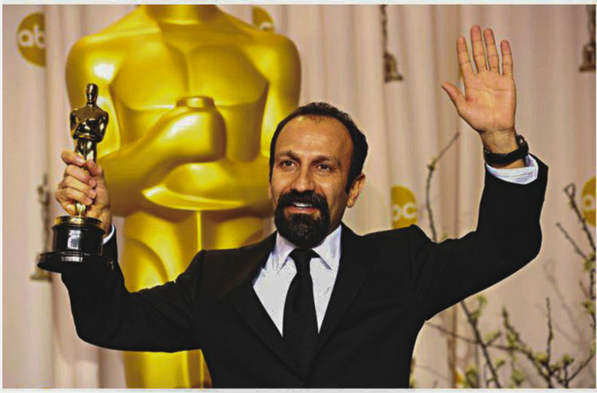
Farhadi won the Oscar for Best Foreign Language Film for "A Separation" in 2012.

Members of Hollywood took to social media on Saturday to speak out in response of Trump's executive order banning refugees from entering the US. The order, signed by Trump on Friday, suspends refugees from entering the United States for four months, and indefinitely suspends Syrian refugees. There is a question whether Oscar-winning Iranian director Asghar Farhadi (who won Best Film in a Foreign Language in 2012 for "A Separation") will be allowed to enter the US to attend the Oscars on February 26, for his film "The Salesman", which is nominated in the foreign language category. The film's star, Iranian actress Taraneh Alidoosti tweeted on Thursday that she plans on boycotting the awards ceremony in protest of Trump. Celebs including Kumail Nanjiani, Ava DuVernay and JK Rowling took to twitter to express disdain towards Trump's actions. Michael Moore tweeted of a Muslim protest occurring in New York while Seth Rogen tweeted, "LA Protest on #Muslimban TODAY 1-5 at Federal Immigration Office, 300 N. Los Angeles St." America Ferrera, who recently led