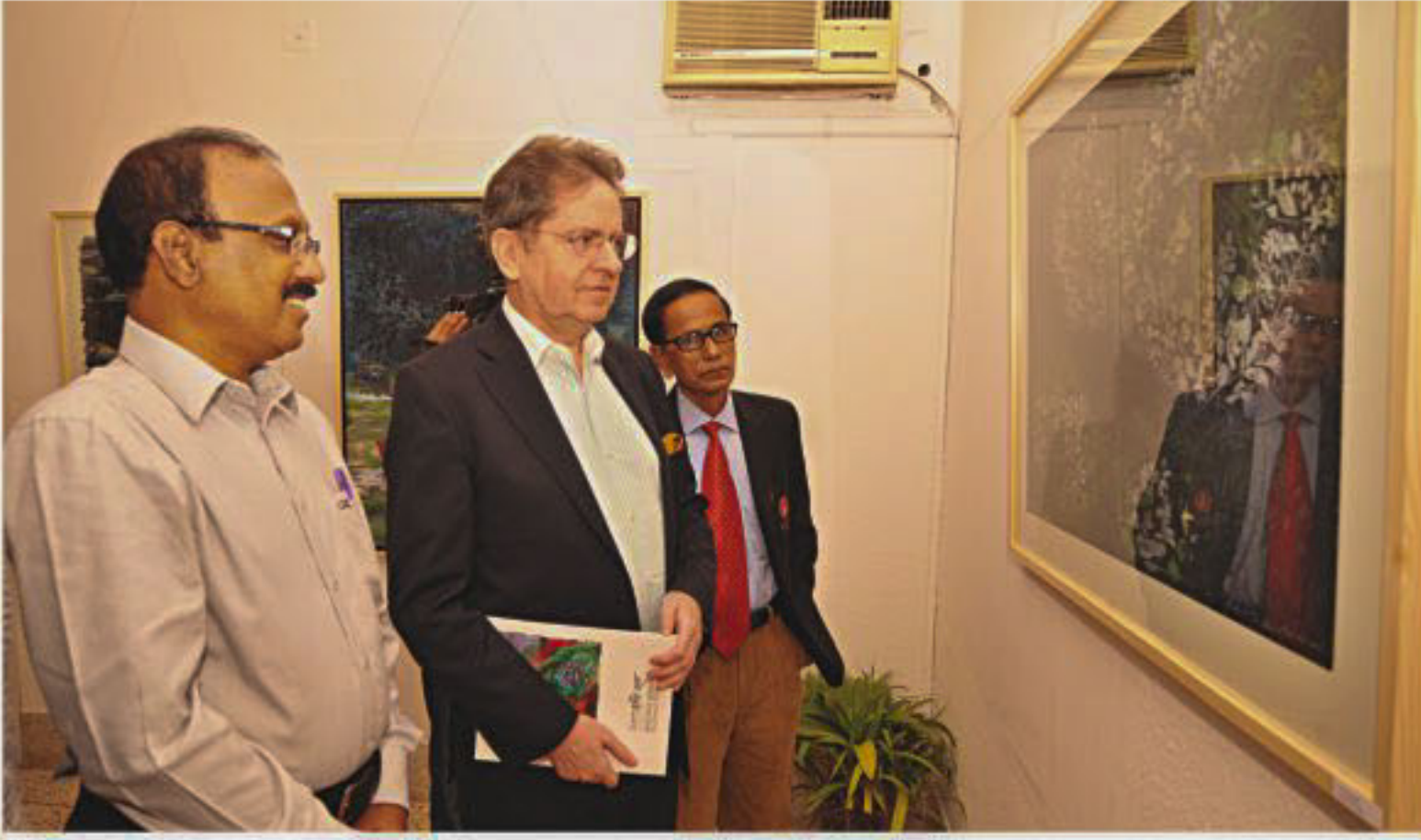
The artist (L) gives the guests a tour of the exhibition.

The artist's patriotic passion is noticeable in several of his works. The sloping beauty of Hijol (Barringtonia acutangula), the blossoming Shapla and water hyacinths, water bodies beside lush greenery and the beauteous contrast of lightning beaming through dark clouds appear in one of his acrylic work "My Homeland-4". Another acrylic with the same title encapsulates the land's riverine beauty with sailing boats, huts, palm trees, greenery and monsoon clouds. The mature hues