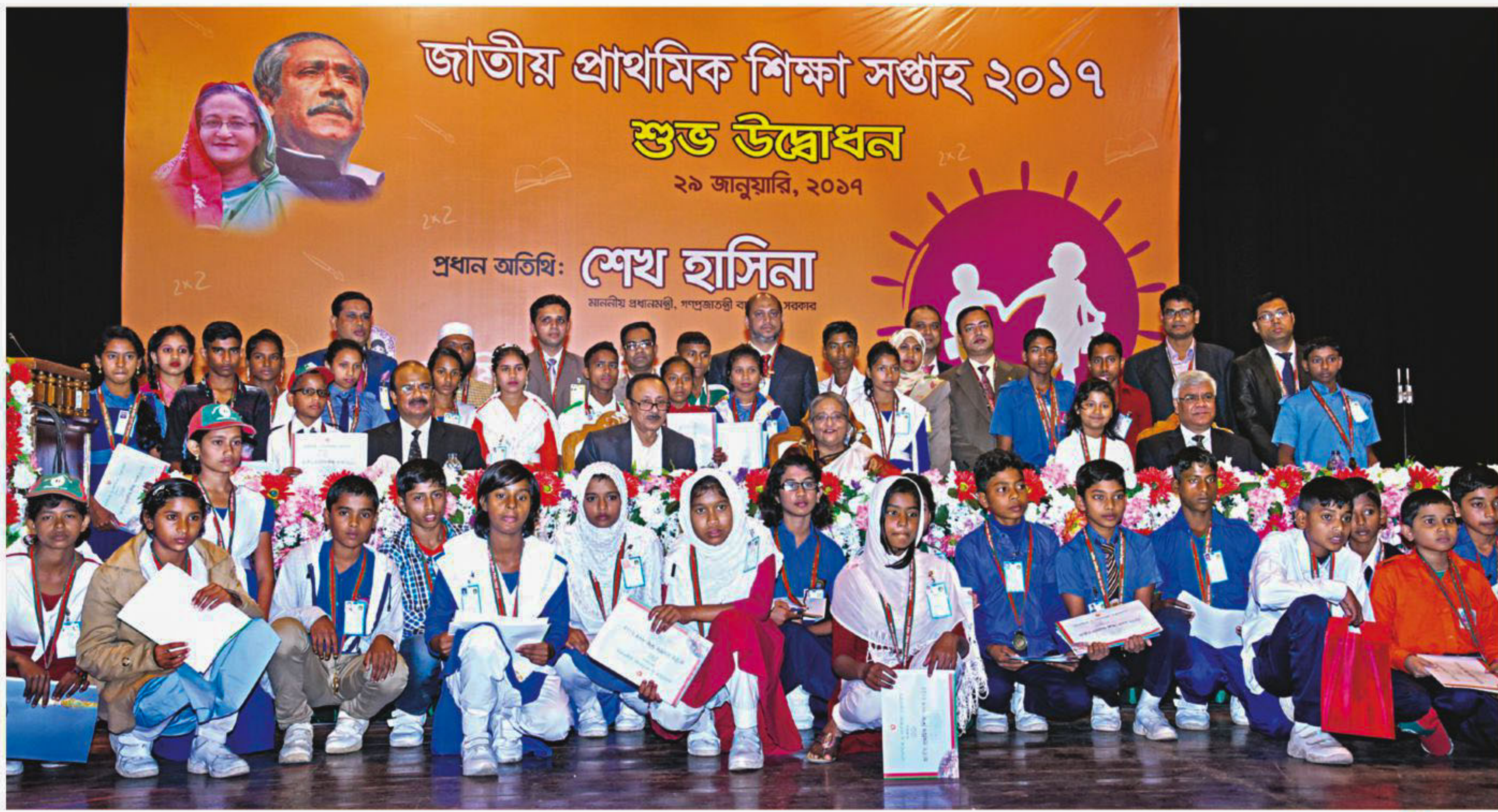
The winners of sports and cultural events of Inter-primary School Competition-2016 with Prime Minister Shiekh Hasina at Osmani Memorial Auditorium in the capital yesterday. Earlier, the premier inaugurated the National Primary Education Week-2017.

Police said they were trying to arrest the culprit.