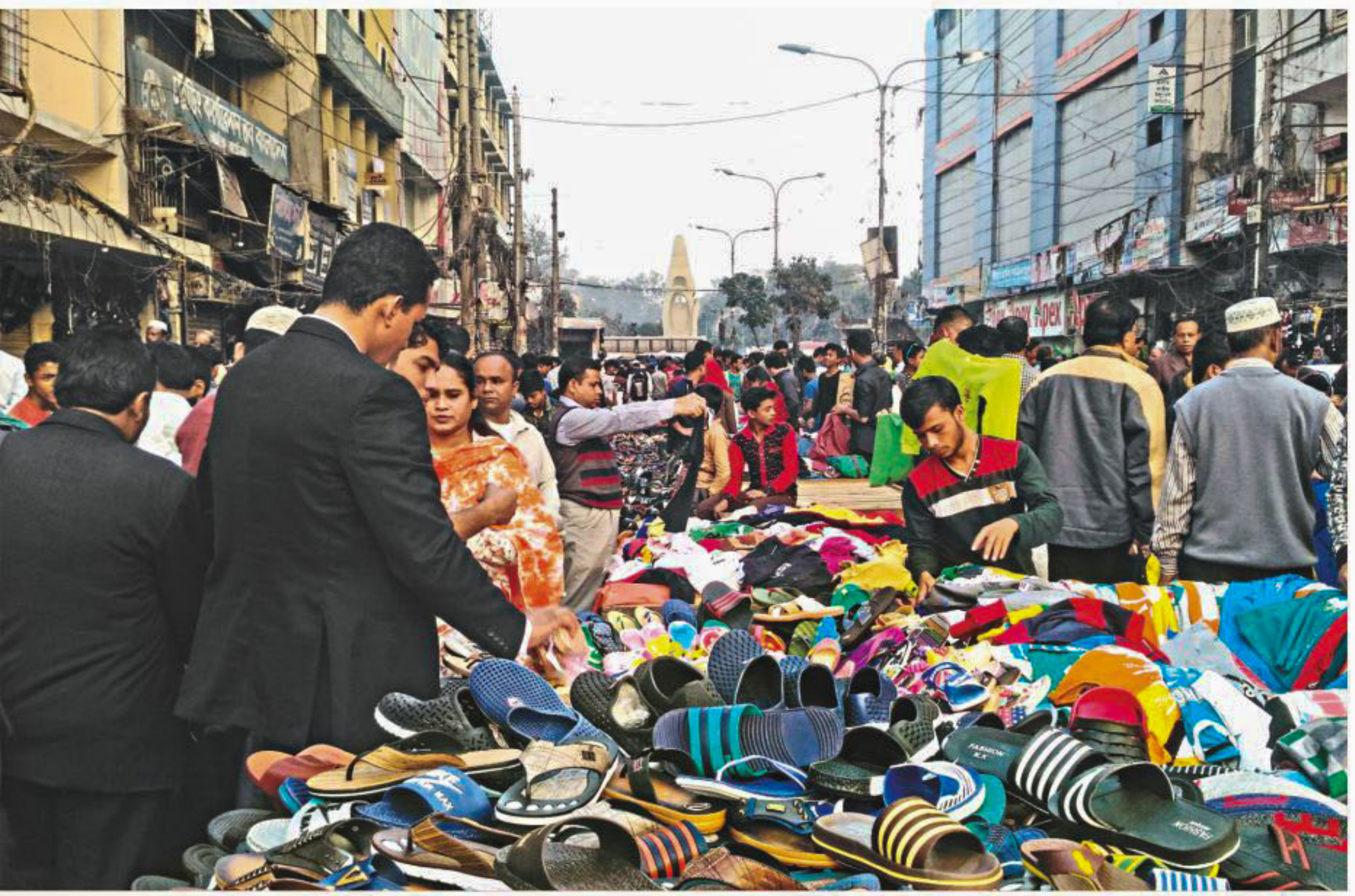
As per the decision of the Dhaka South City Corporation, hawkers selling their goods on Saturday afternoon (a weekly holiday) near Gulistan's Golap Shah Mazar (shrine).