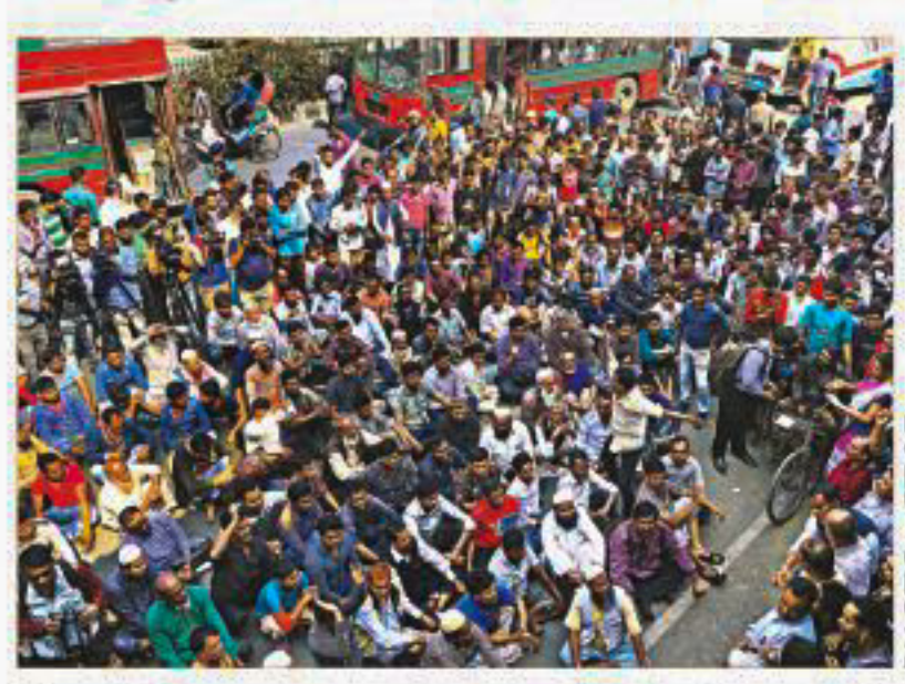
Hawkers at a protest rally in front of Jatiya Press Club yesterday.

But they will be allowed to sit at some selected places from 6:30pm onwards during the working days, and will be allowed to do business all day on the holidays, he said at a meeting with a group of hawker leaders.