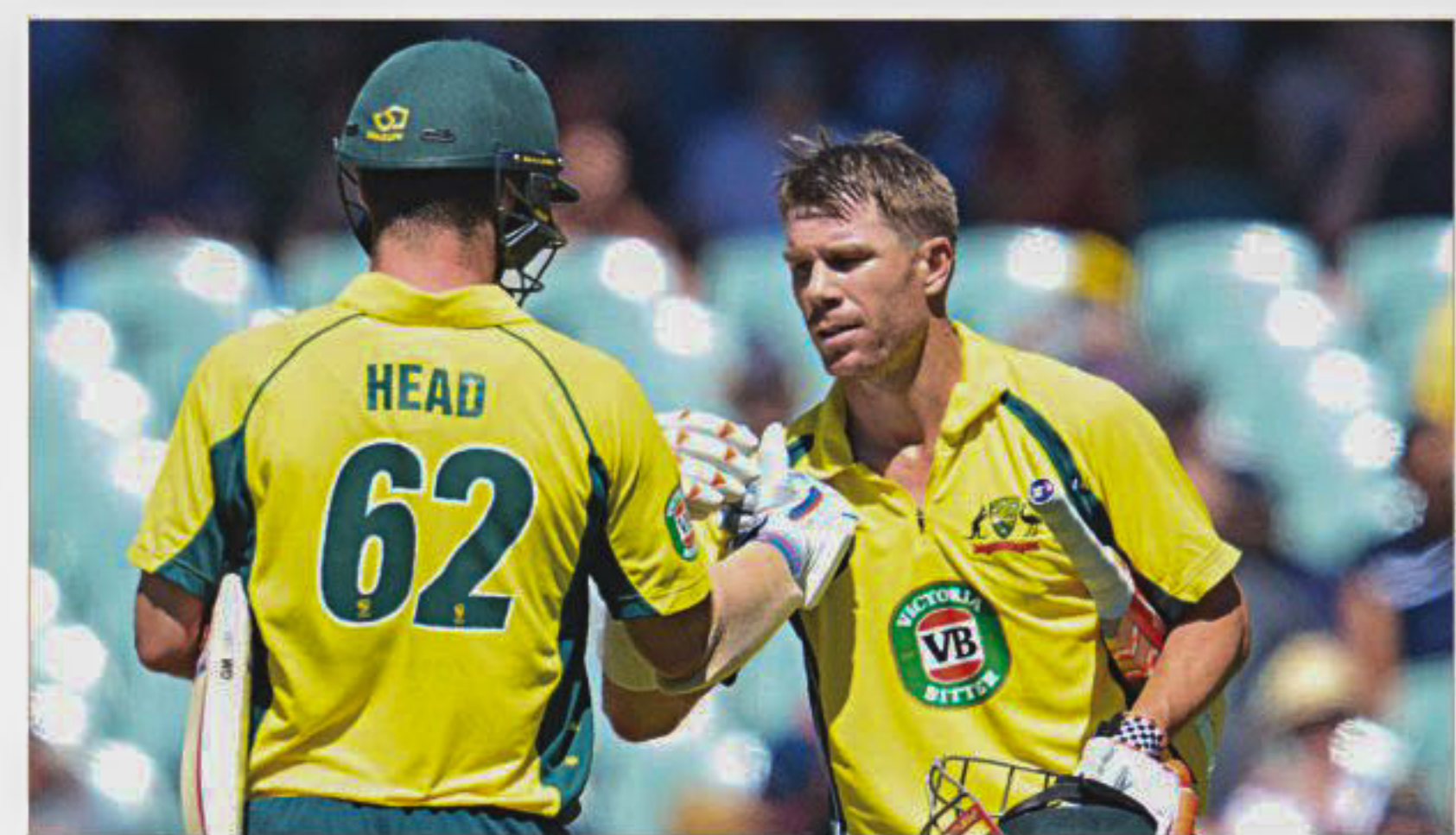
David Warner (R), who scored 179, forged Australia's highest ever one-day partnership with fellow centurion Travis Head during the fifth and final ODI against Pakistan at the Adelaide Oval yesterday.