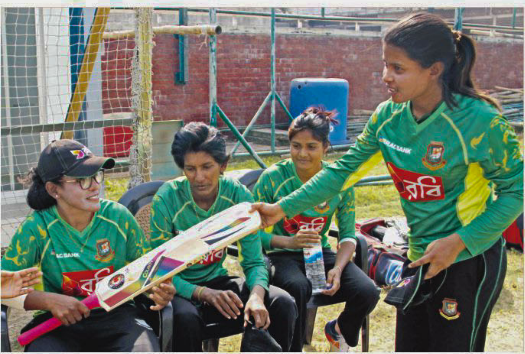
The Tigresses began their preparations at the BCB Academy Ground in Mirpur yesterday ahead of next month's 2017 Women's World Cup Qualifier.